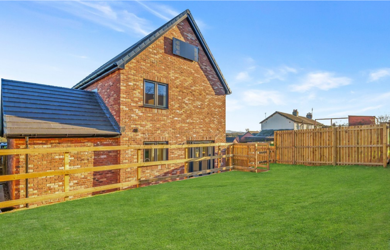
Rear Elevation and Garden