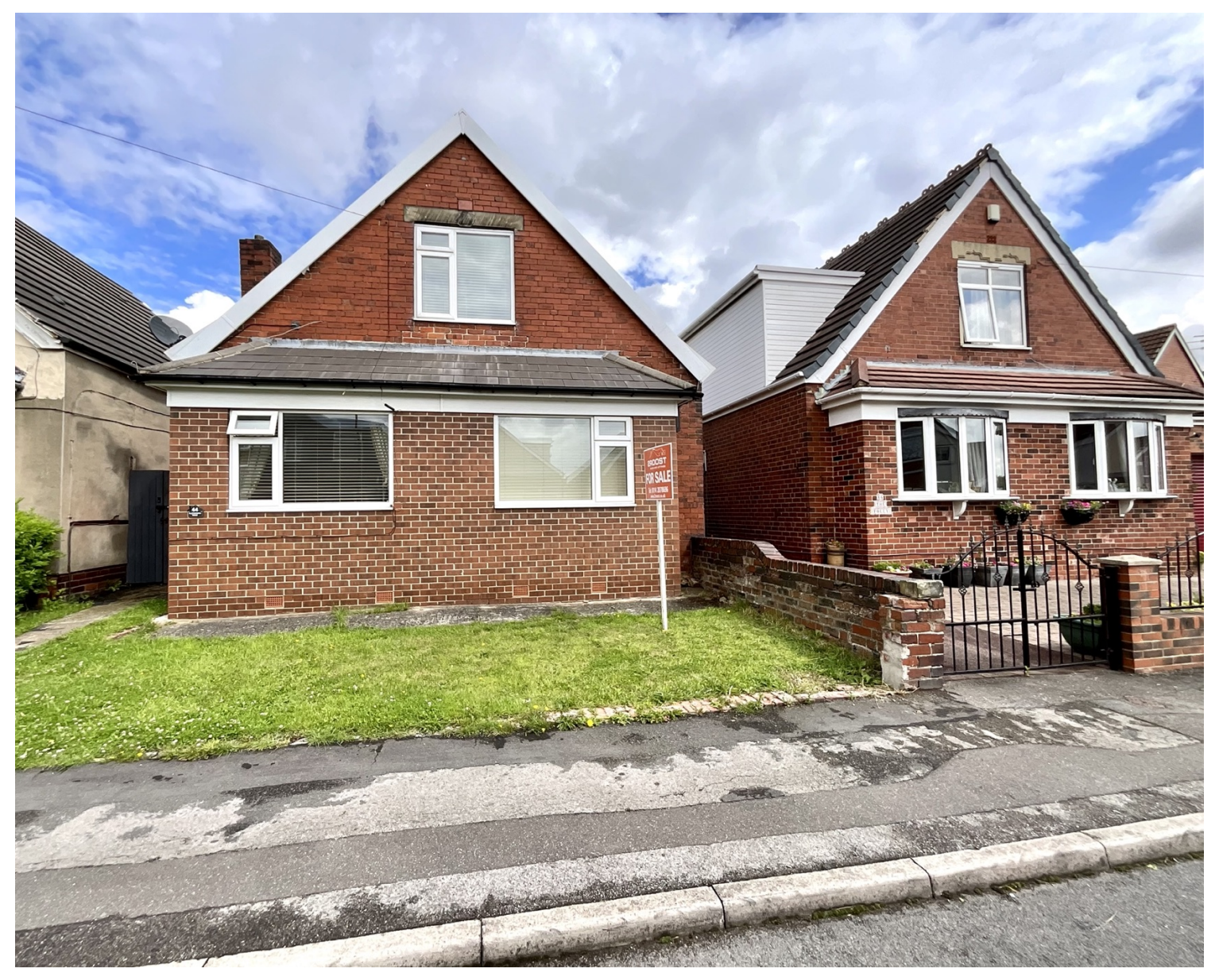
***GUIDE PRICE £205,000-£215,000*** Spacious and very well presented throughout is this four bedroom detached property offering versatile and flexible living space including spacious lounge, modern kitchen, dining room, utility room and downstairs WC. Also having good sized garden with garden bar. There is uPVC double glazing and gas central heating.