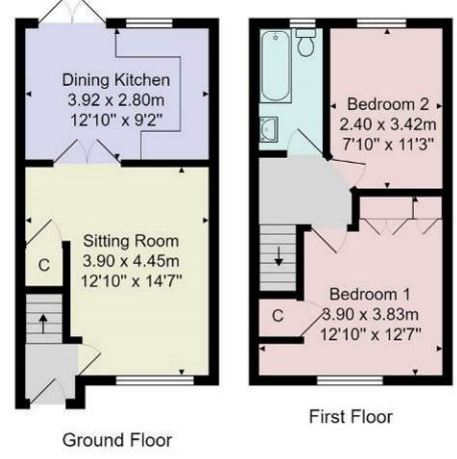
Total Area: 58.6 m² ... 631 ft² All measurements are approximate and for display purposes only. No liability is accepted by either the agency or Box Property Solutions Ltd as to the exact measurements of the rooms. Box Property Solutions Ltd retains the copyright on this plan and allows agents to use it with agreed permission.