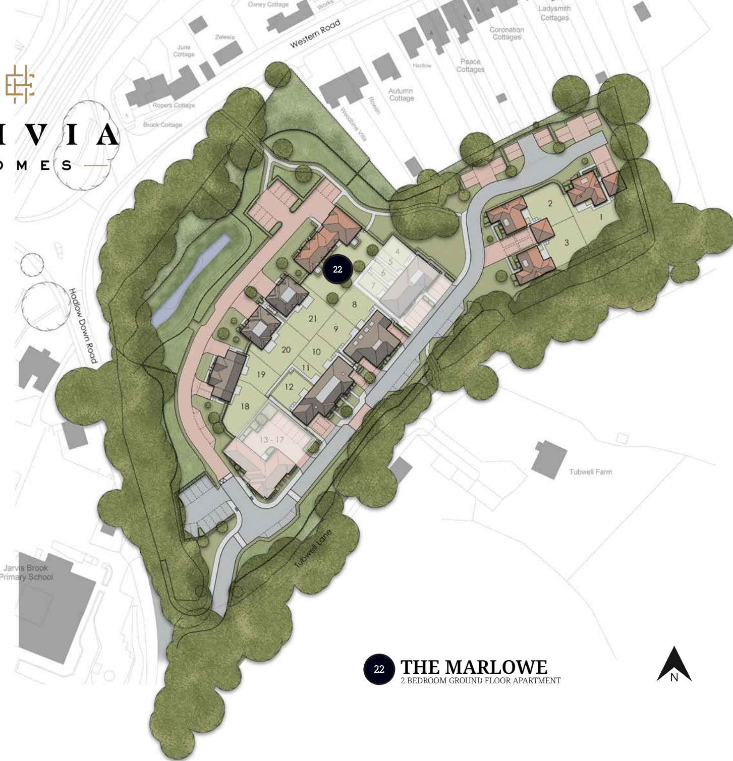
22 THE MARLOWE 2 BEDROOM GROUND FLOOR APARTMENT