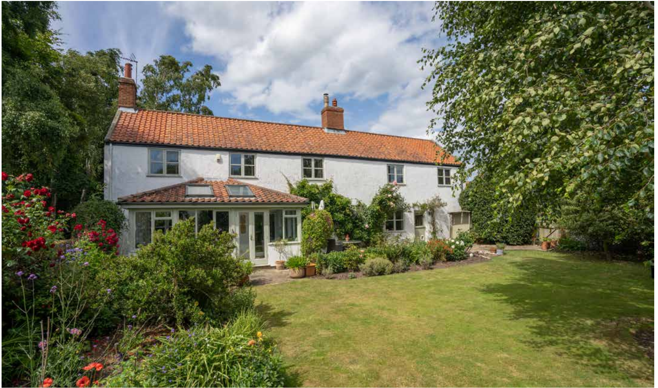
White House Farm The Street | West Somerton | Norfolk | NR29 4EA