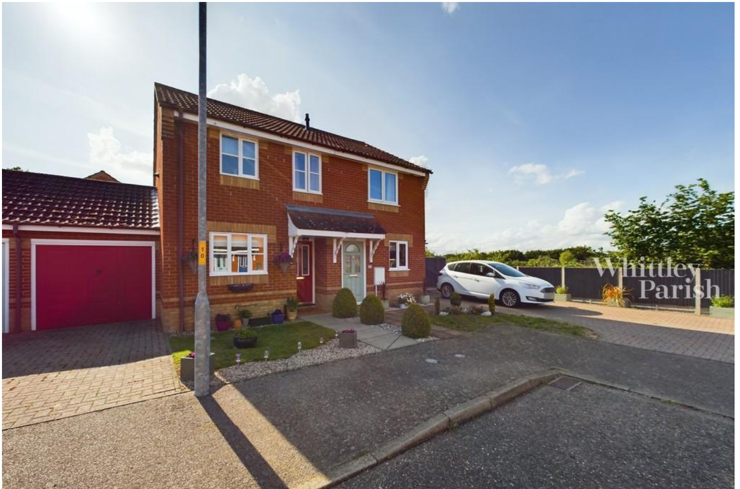
Appletree Lane, Roydon, Diss, IP22 4TL Guide Price £220,000