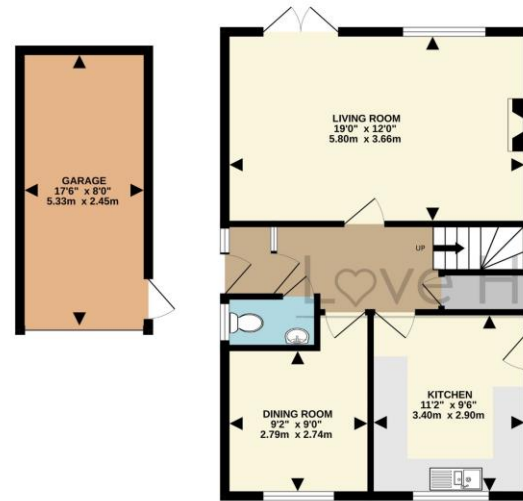
GROUND FLOOR 689 sq.ft. (64.0 sq.m.) approx.