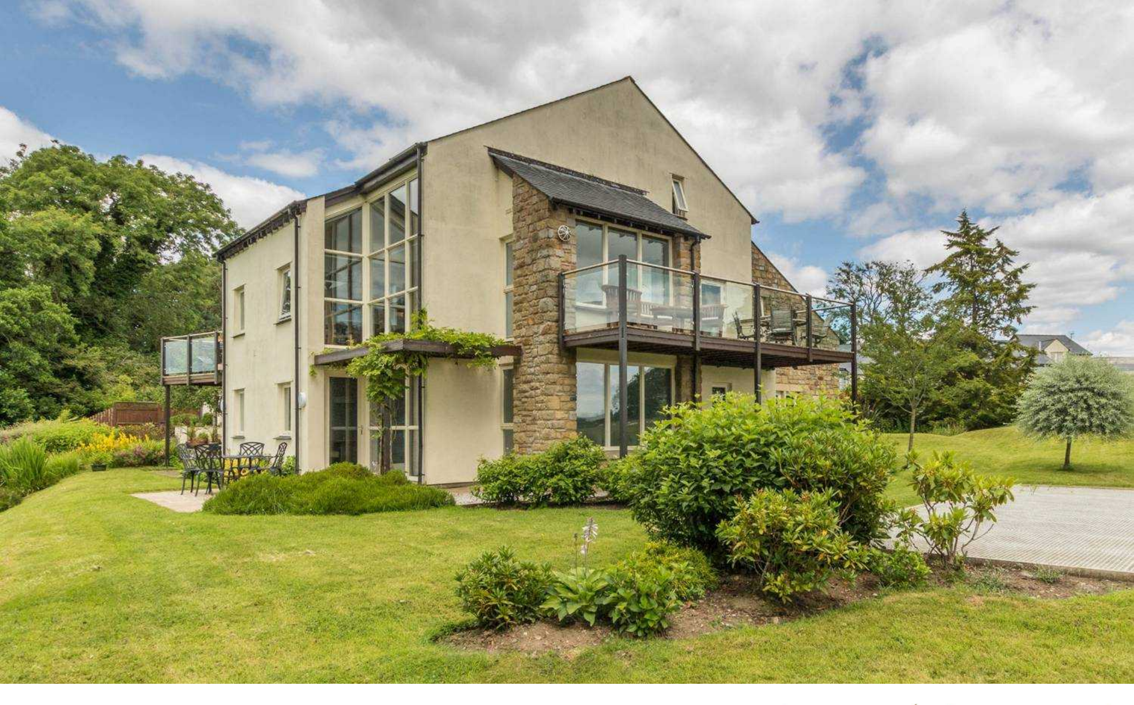
7 The Meadows, Kirkby Lonsdale £325,000