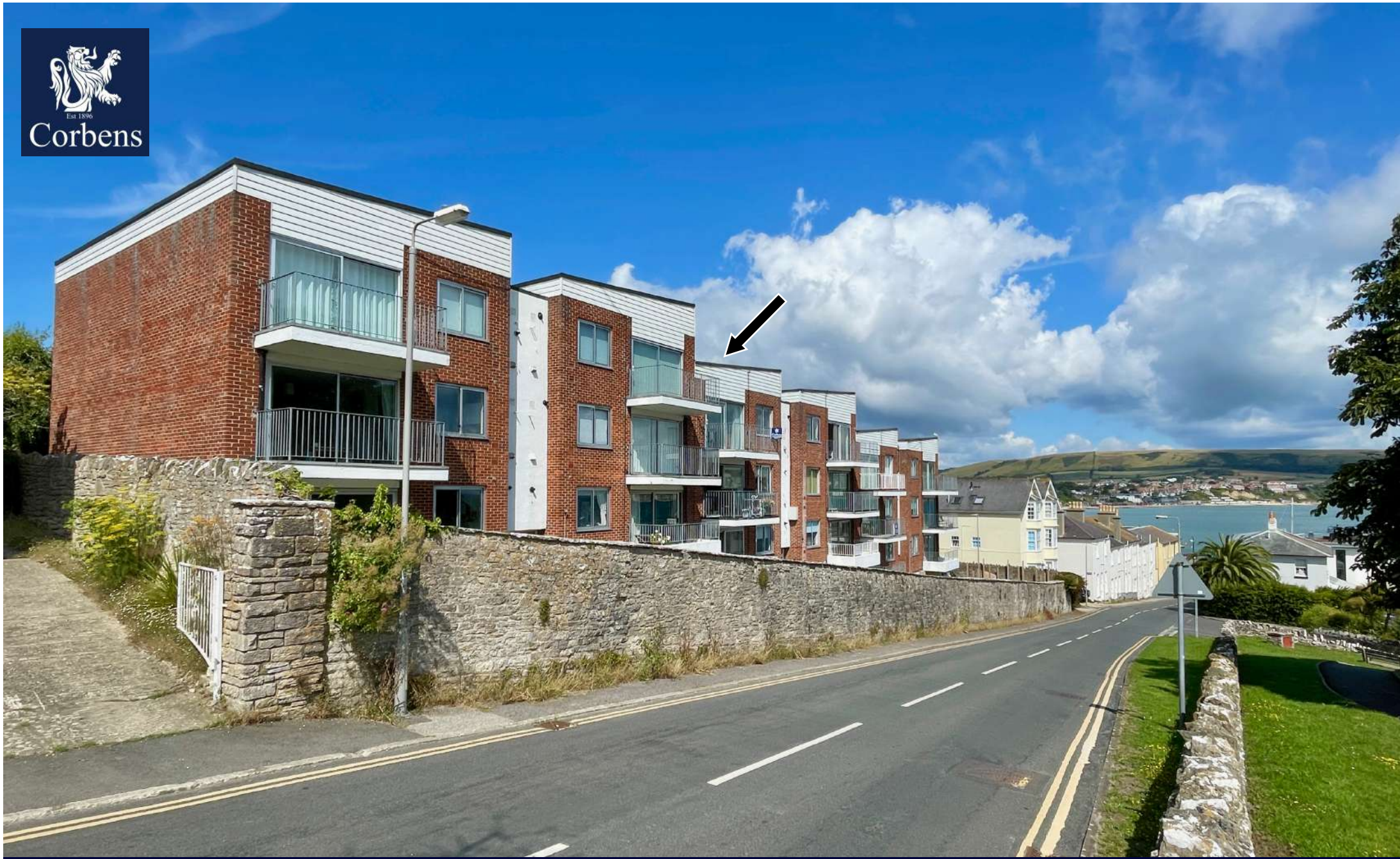
23 PEVERIL HEIGHTS, SENTRY ROAD, SWANAGE £395,000 Shared Freehold