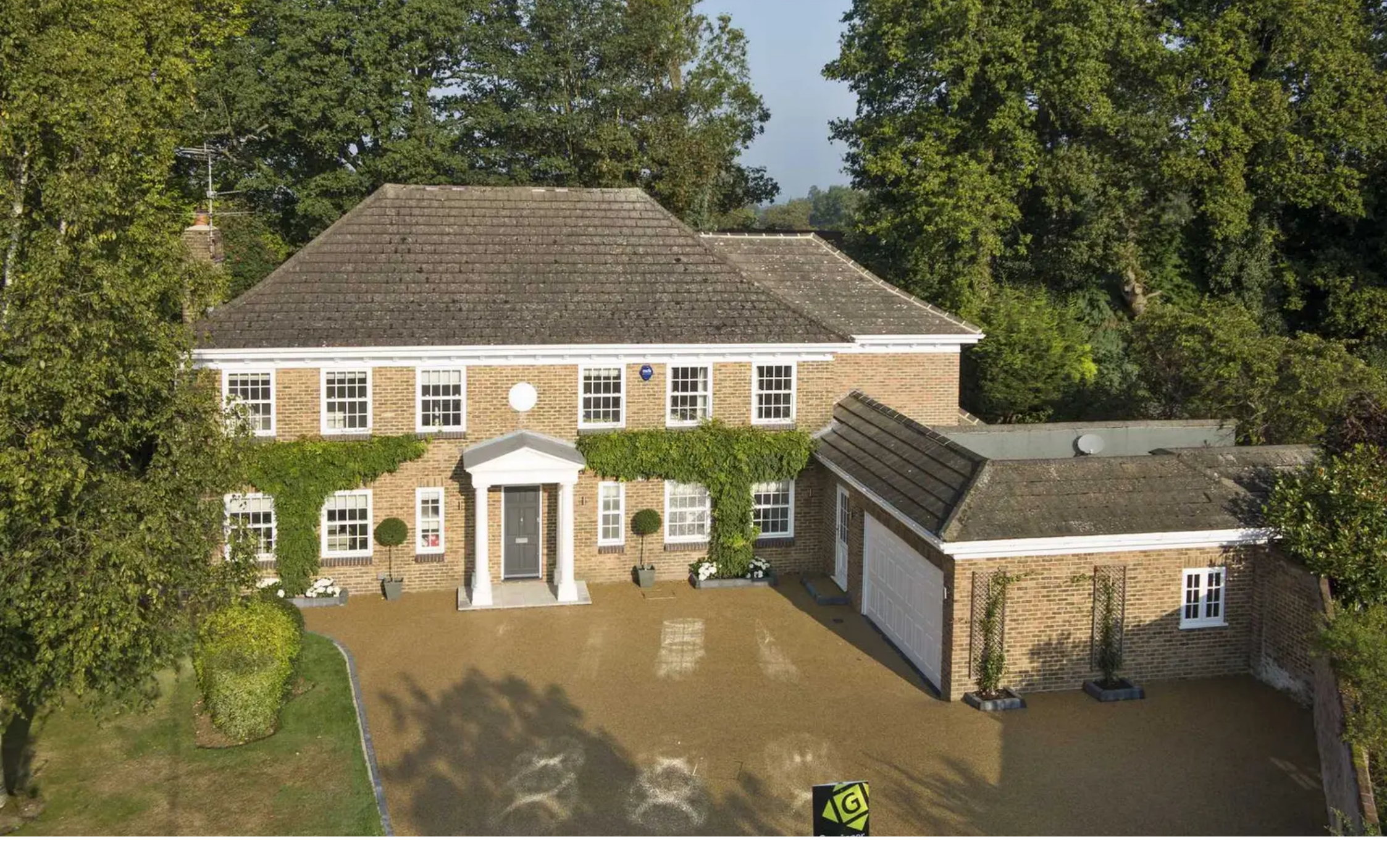
41 Burleigh Park, Cobham £8,500 pcm