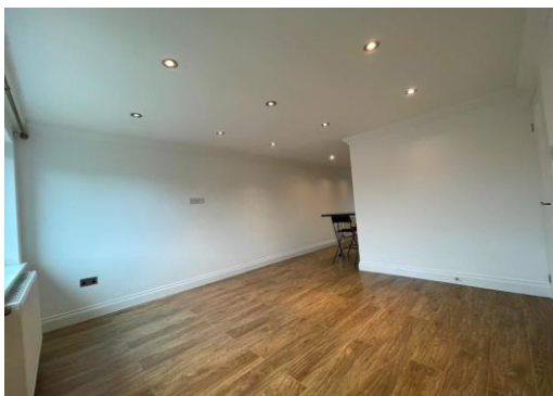
Immaculate 1 bedroom 1st Floor Flat