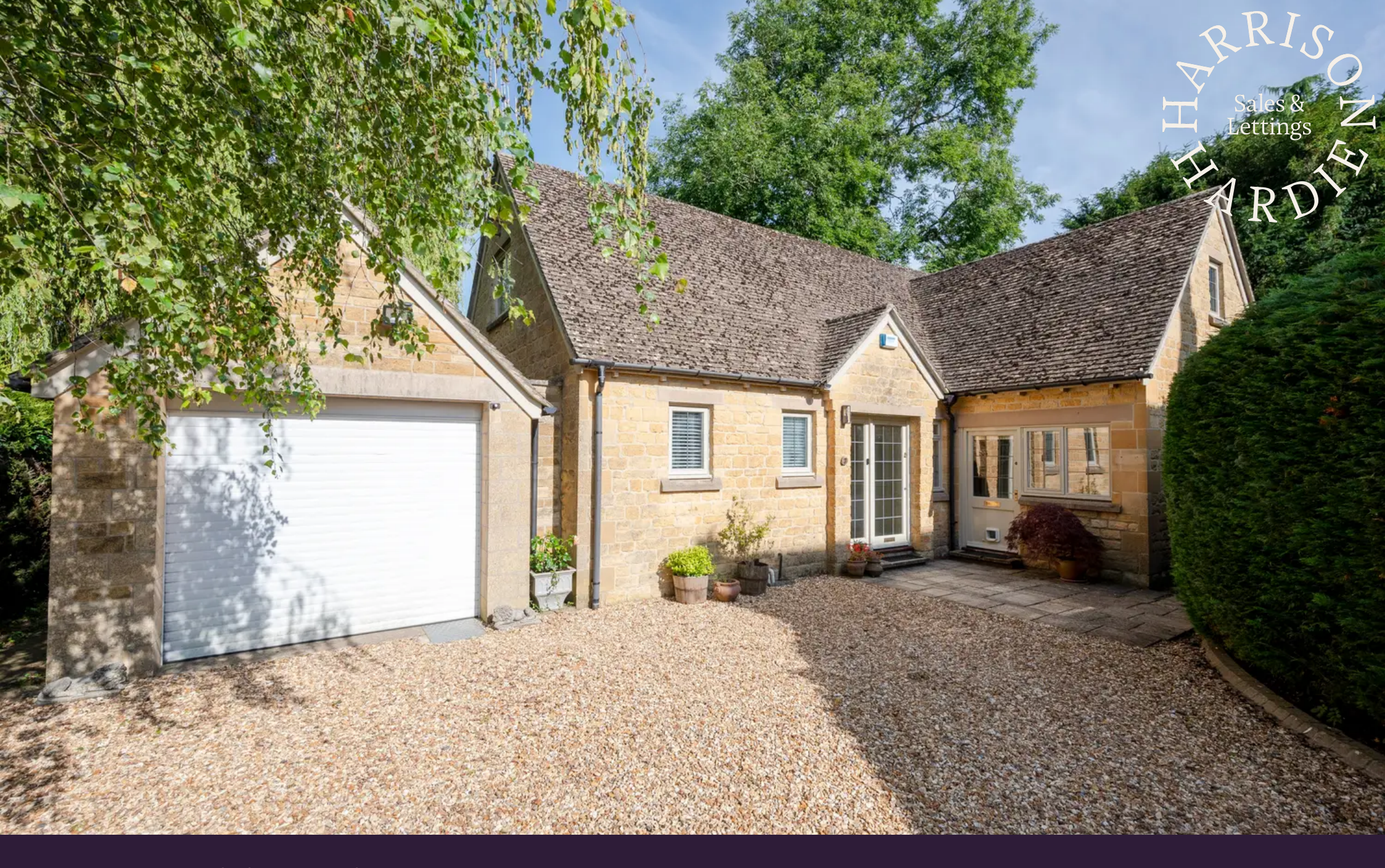
Rivington Glebe, Little Compton, GL56 0TD Guide Price £700,000