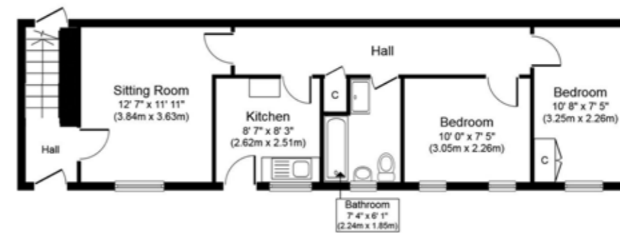
Ground Floor Approximate Floor Area 591 sq. ft. (54.9 sq. m.)

Whilst every attempt has been made to ensure the accuracy of the floor plan contained here, measurements of doors, windows, rooms and any other items are approximate and no responsibility is taken for any error, omission, or mis-statement. This plan is for illustrative purposes only and should be used as such by any prospective purchaser or tenant. The services, systems and appliances shown have not been tested and no guarantee as to their operability or efficiency can be given.