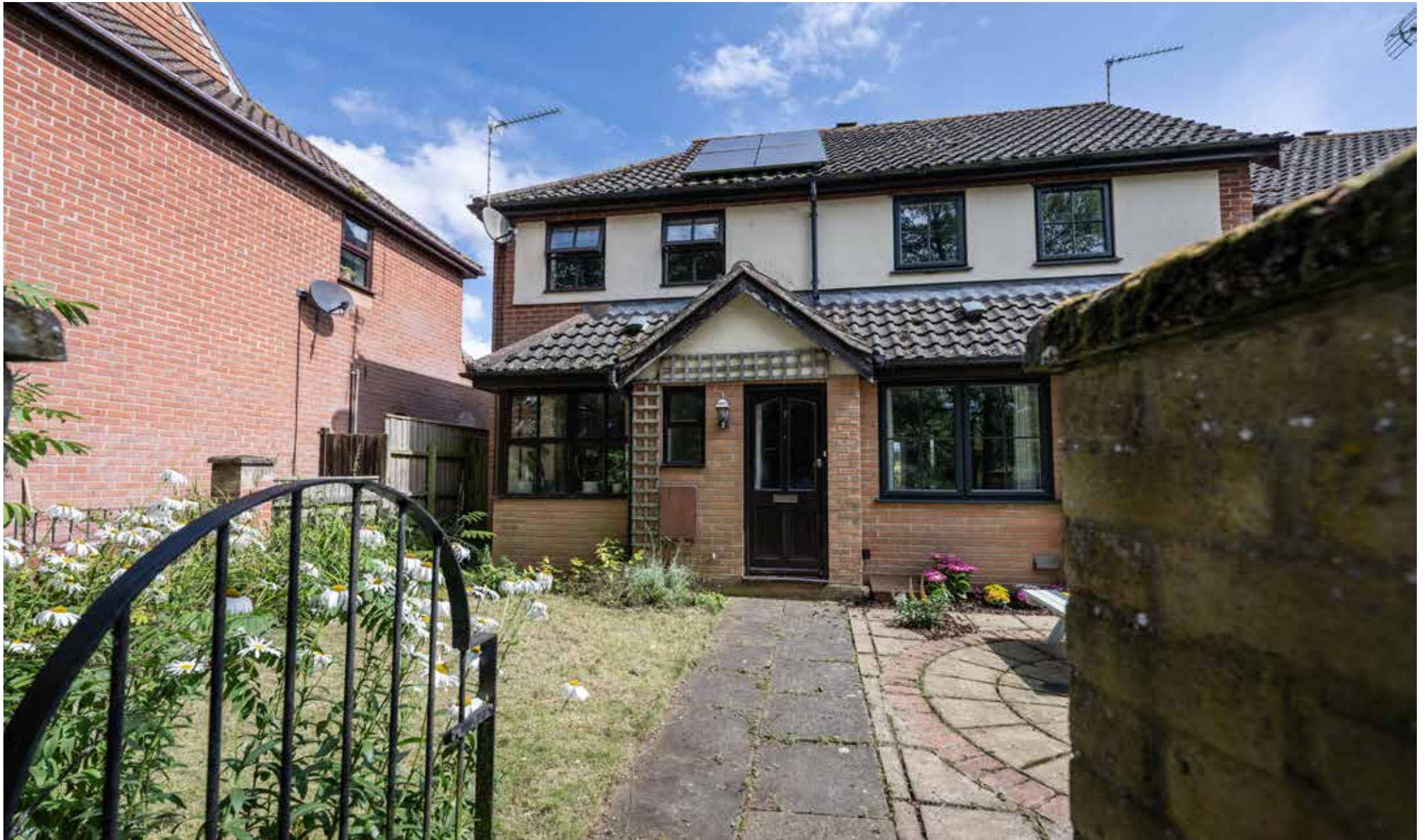
7 Bridges Walk Fakenham | Norfolk | NR21 9TB