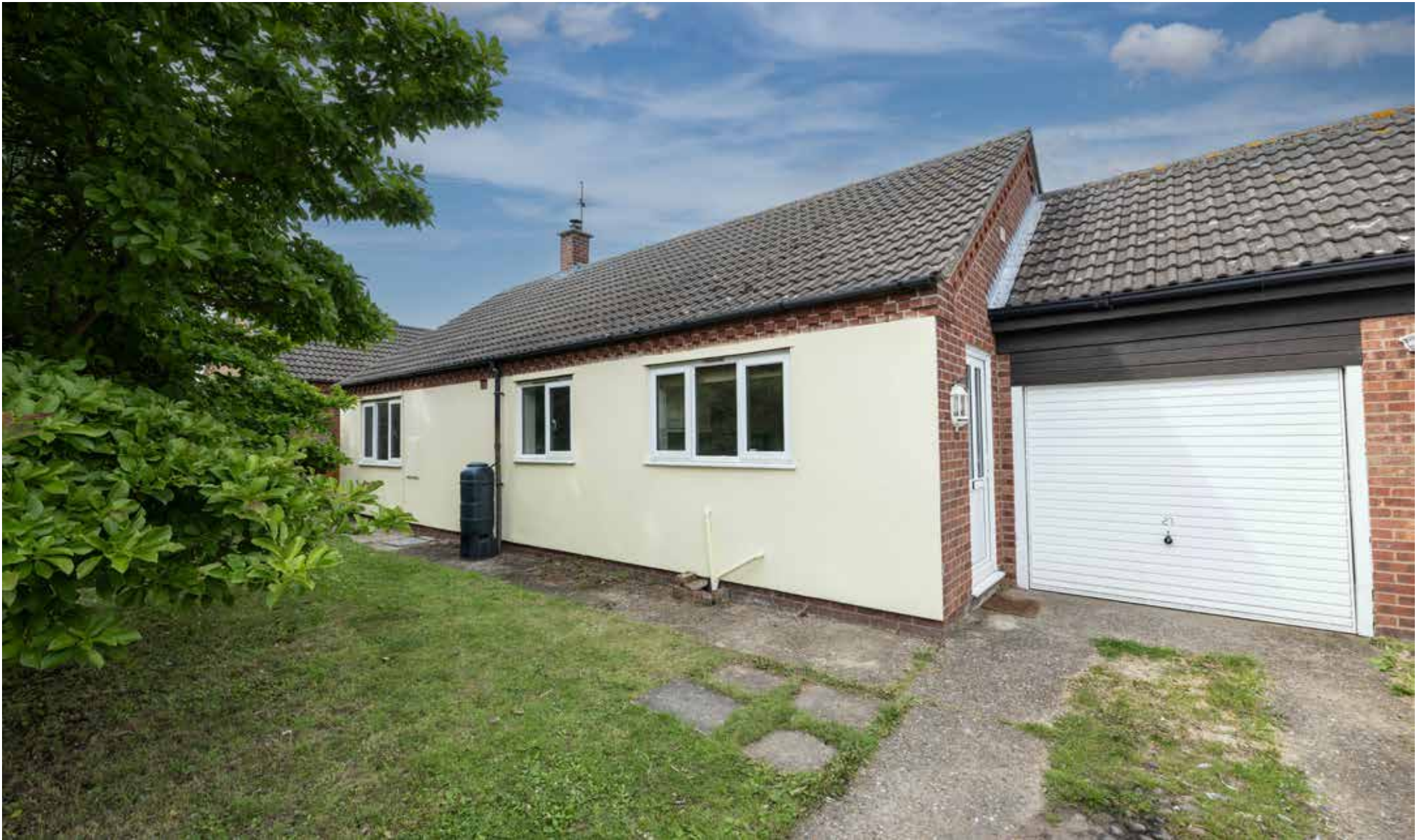
27 The Cornfield Langham | Holt | Norfolk | NR25 7DQ