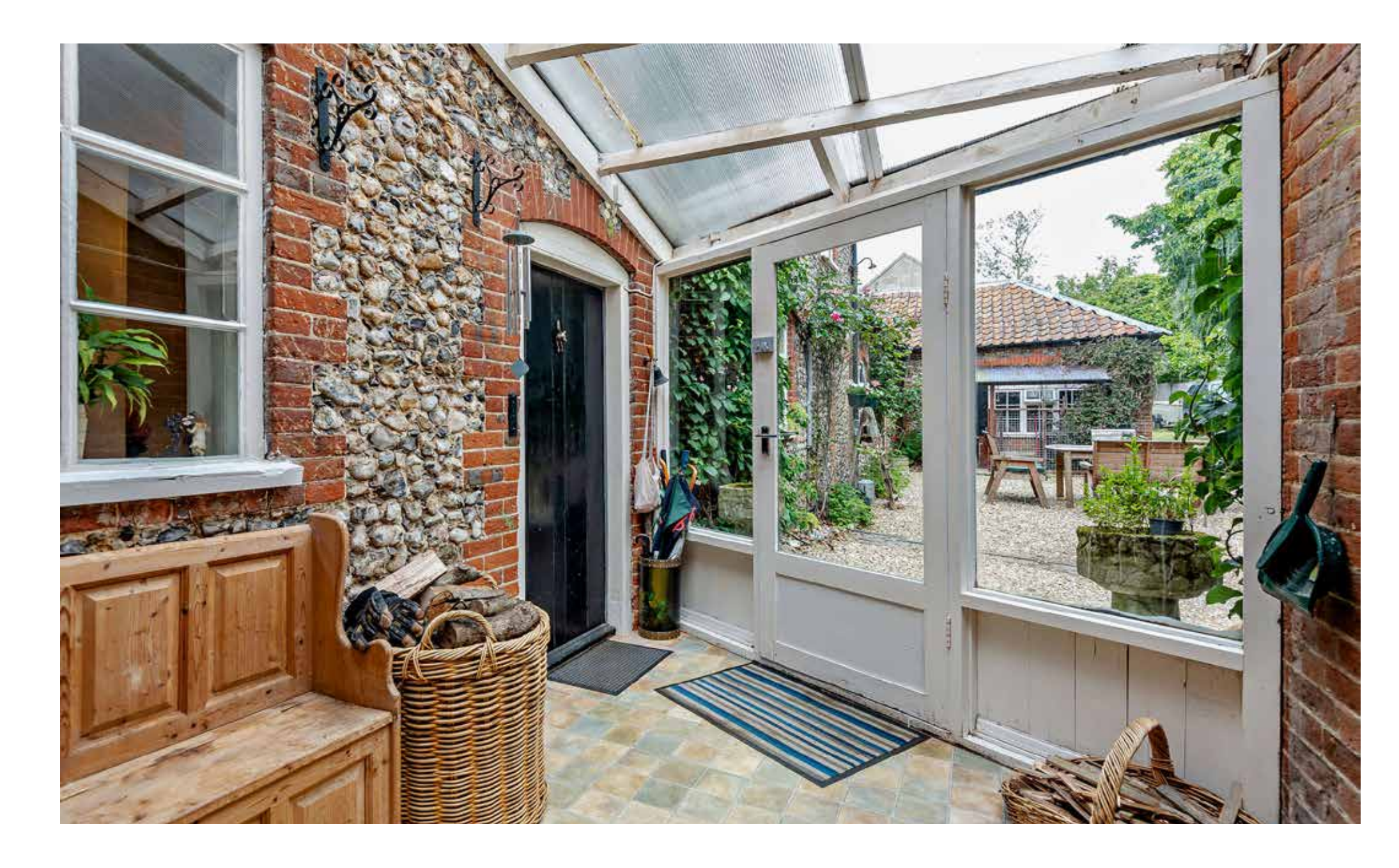
"...what drew us here was the sense of space and freedom that allowed us and the children to really spread out...."