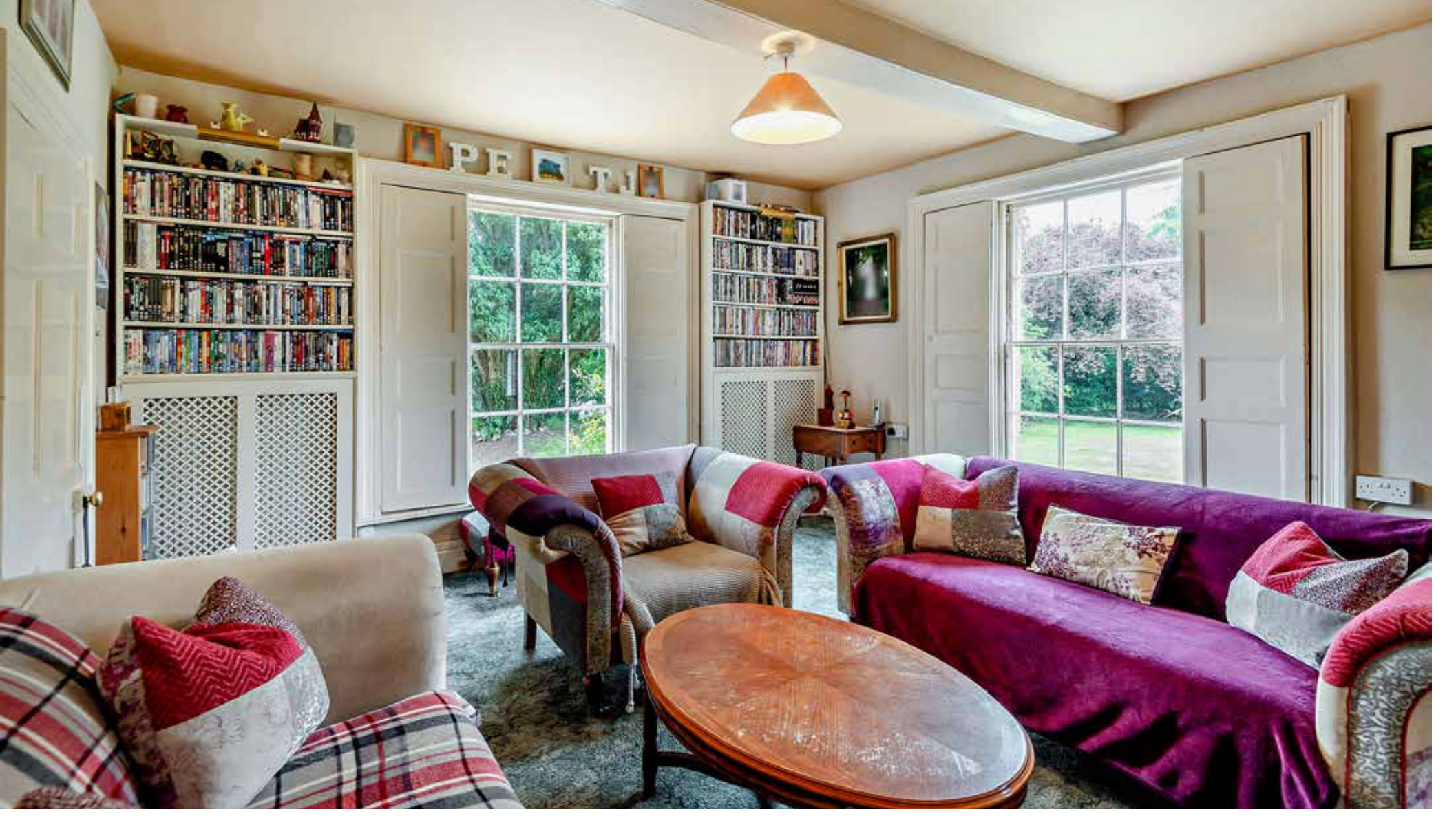
"We've been able to host enormous family parties and a wedding here, everyone is always surprised at just how much house there actually is..."