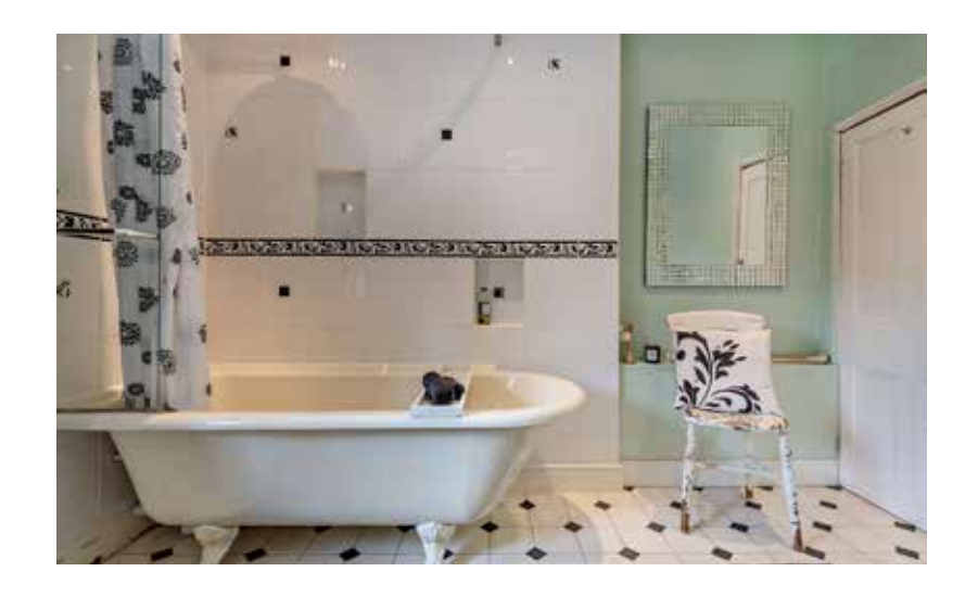
"...a large and luxurious space for relaxing in the roll-top bath after a busy day..."