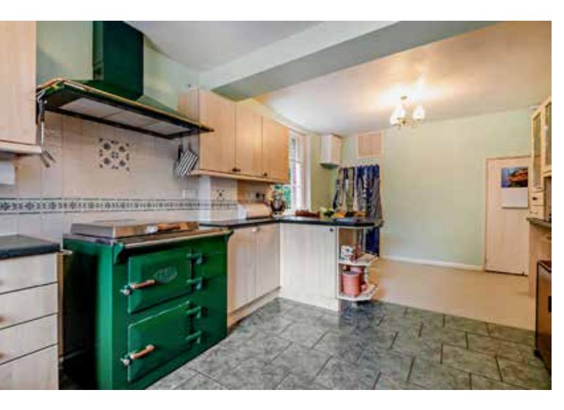
"... the house is just bursting with possibility and potential..."