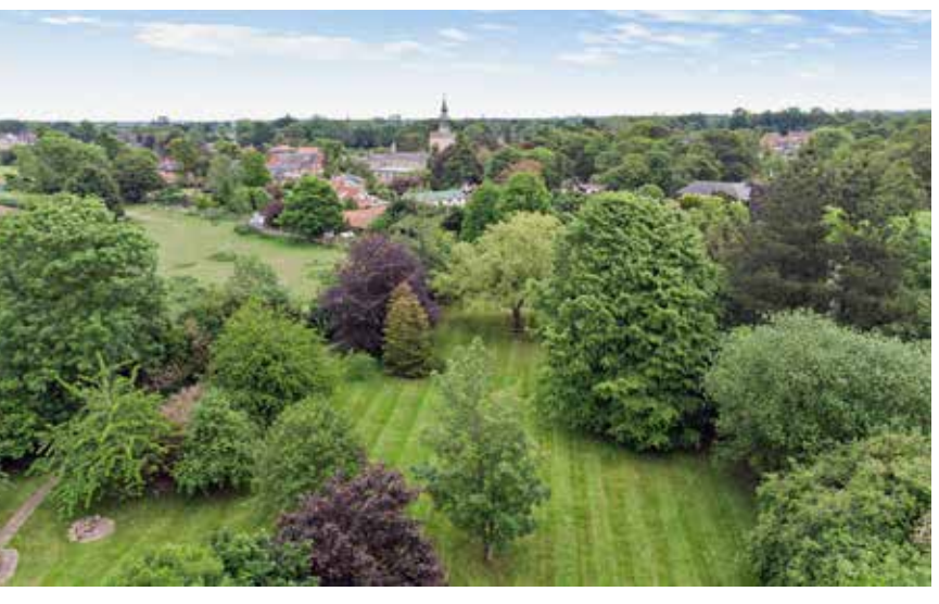
"...The location of the property is ideally placed in the village to take easy advantage of all the daily amenities..."