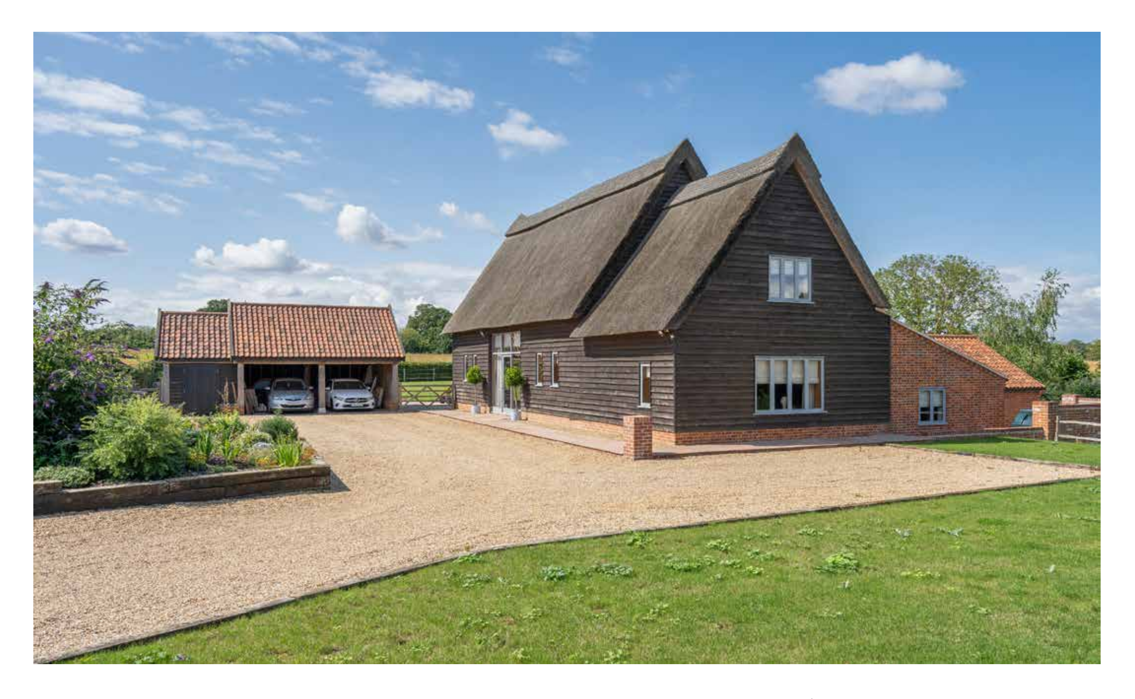
Upper Thatch Barn Loddon Road | Mundham | Norfolk | NR14 6EJ