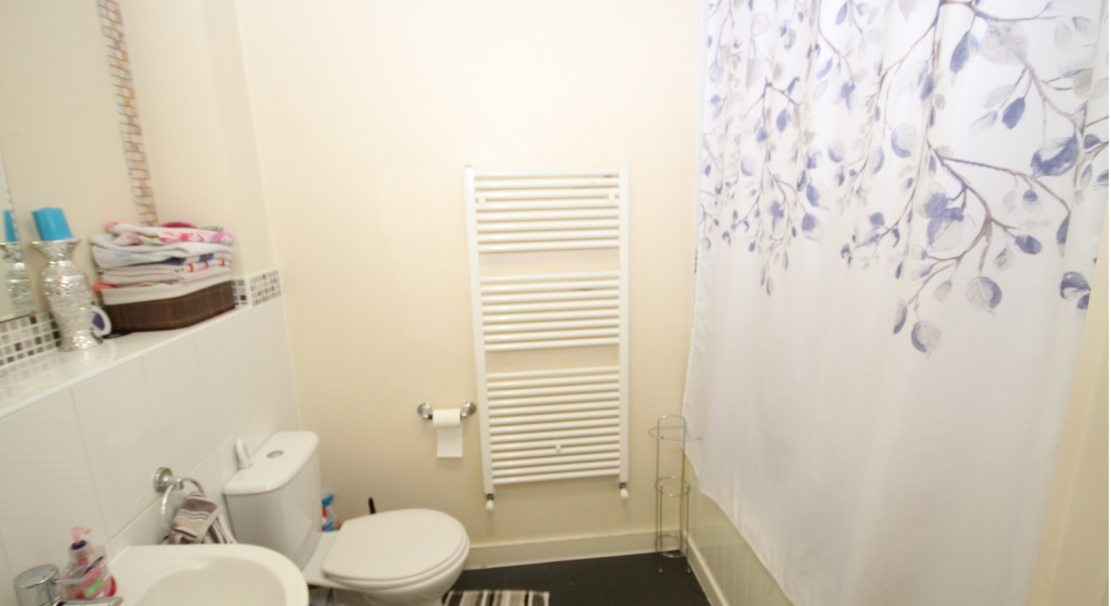
Offered with no further chin is this Two Double Bedroom, Two Bathroom First floor flat. Internally the property is presented in good condition and has a large entrance hall, spacious lounge/diner with an open plan kitchen, two double bedrooms with the master benefitting from En-Suite in addition to the family bathroom. The property is placed within this popular development alongside the grand union canal.