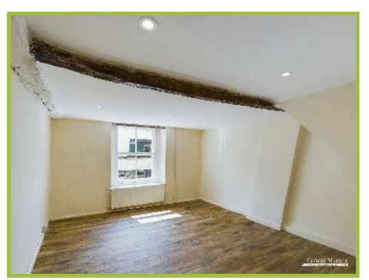
Salisbury Street, Shaftesbury