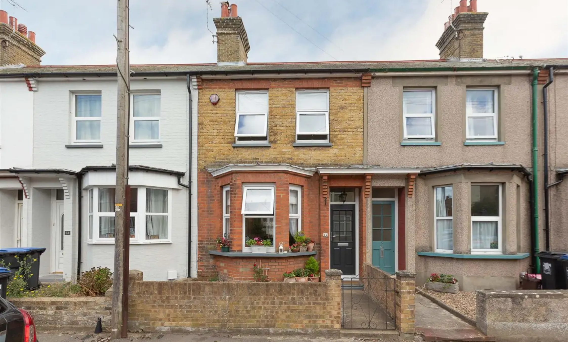
22 Crescent Road, Birchington In Excess of £300,000