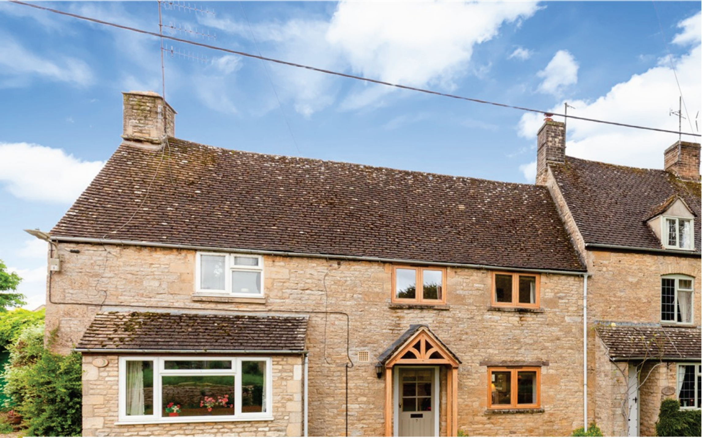
Church View, Ascott-under-Wychwood