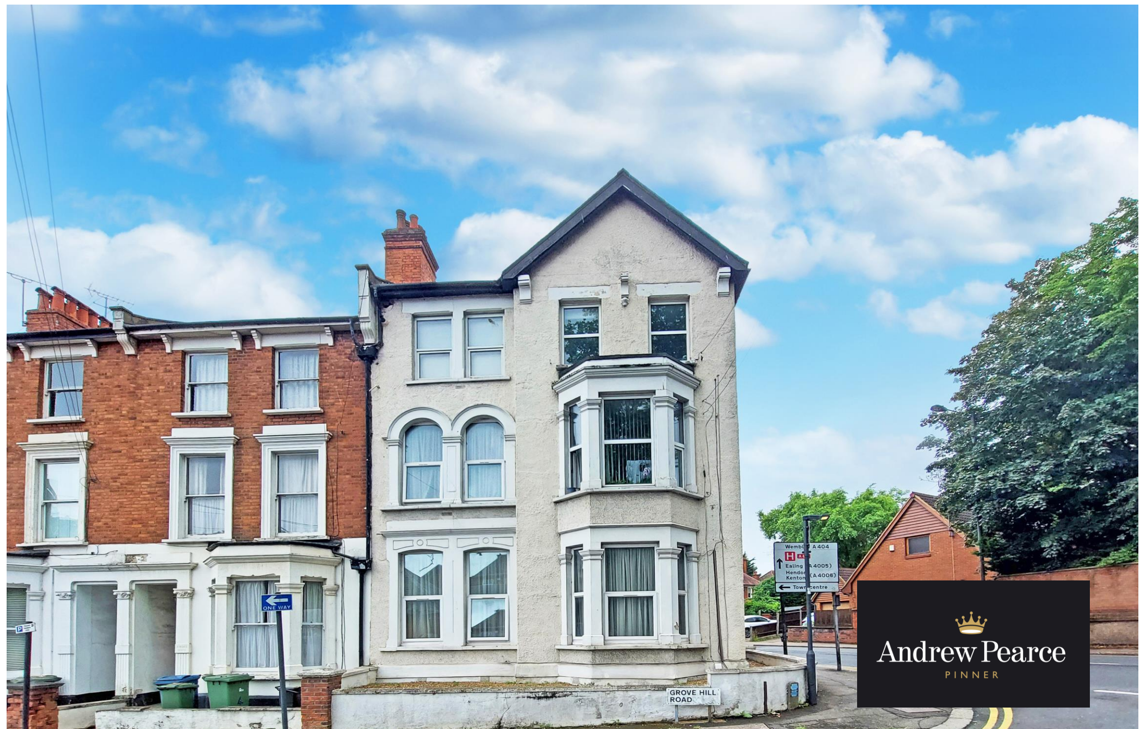
GROVE HILL ROAD, HARROW, HA1 3AB £