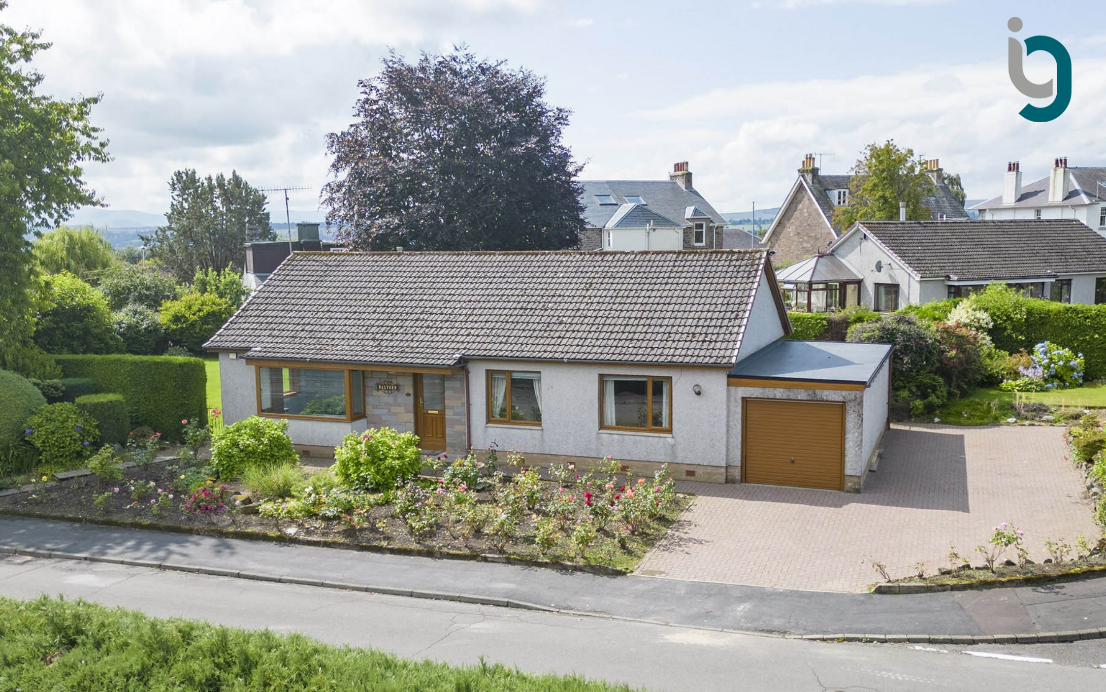
MALVERN, 32 OCHILVIEW GARDENS, CRIEFF, PERTSHIRE, PH7 3EW