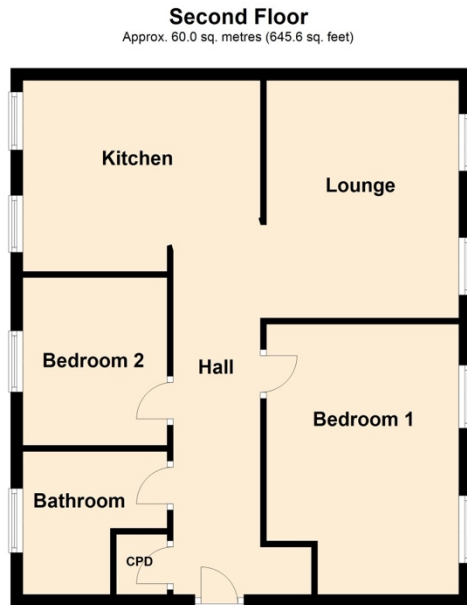
Second Floor Approx. 60.0 sq. metres (645.6 sq. feet)

Total area: approx. 60.0 sq. metres (645.6 sq. feet)