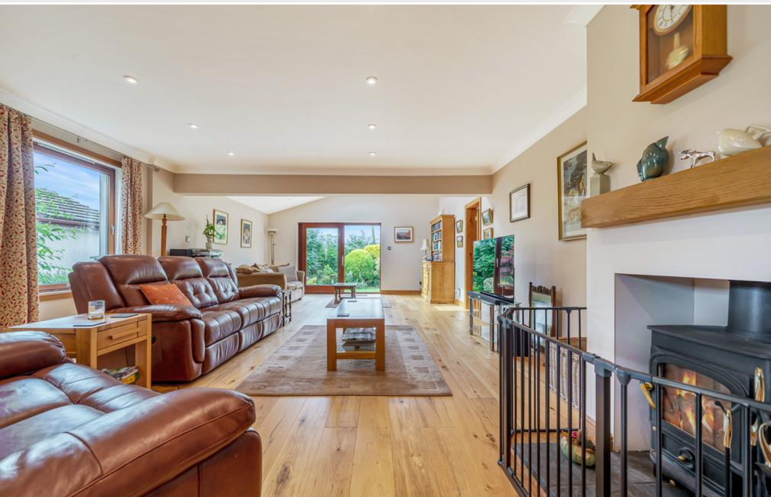
Open Plan Living / Dining Room