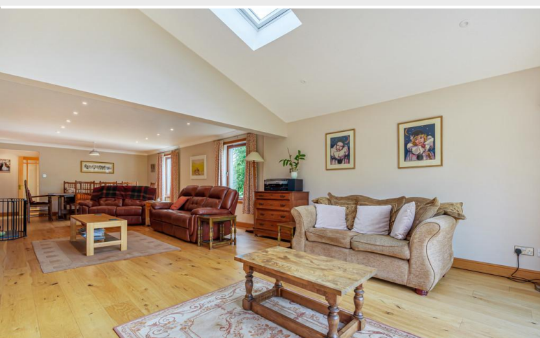
Open Plan Living / Dining Room