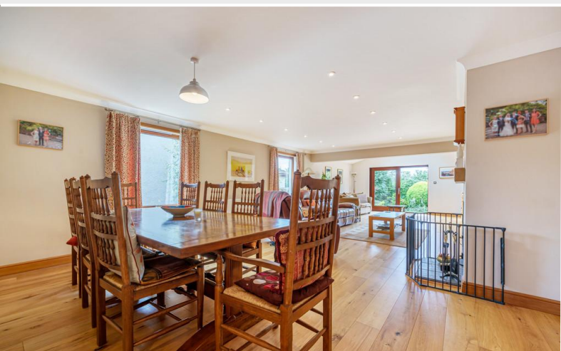
Open Plan Living / Dining Room

Directly in front of you lies Bedroom 4, a flexible space currently housing a utility area, that could easily be transformed into a playroom or home office, offering endless possibilities for customisation to suit your lifestyle needs. This room provides access into the WC cloakroom, and an additional storage room. The utility area comprises of stainless steel sink with mixer taps. Availability for washing machine and tumble dryer. Access leading into the garage.