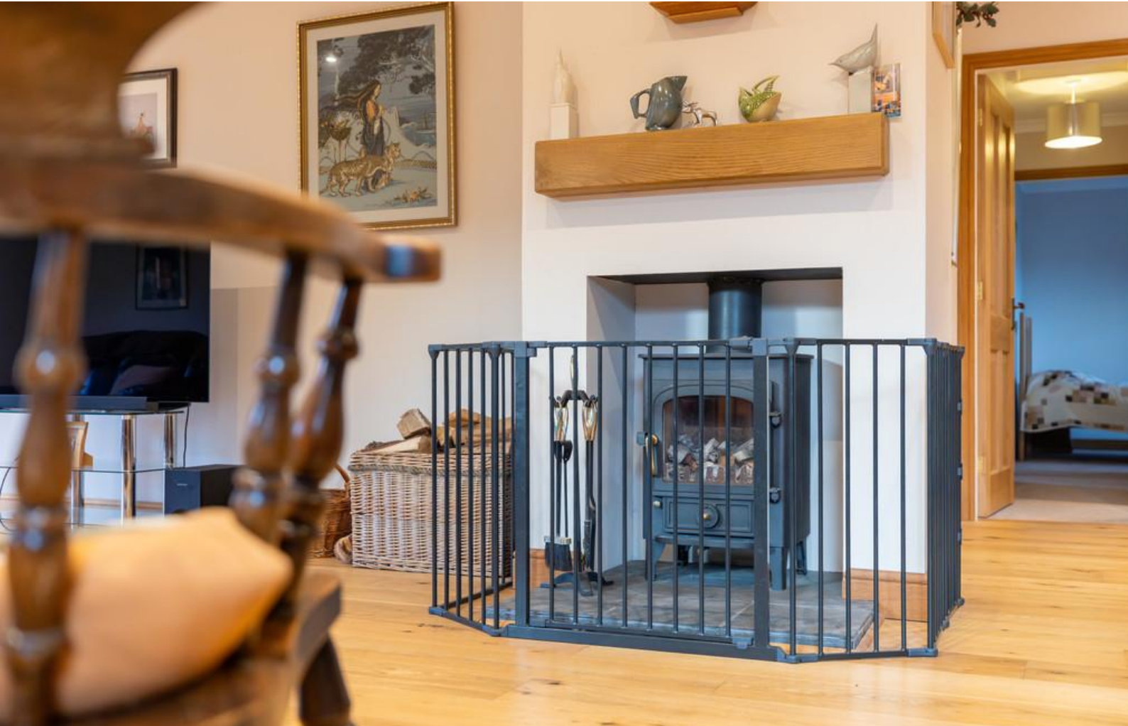
Open Plan Living / Dining Room