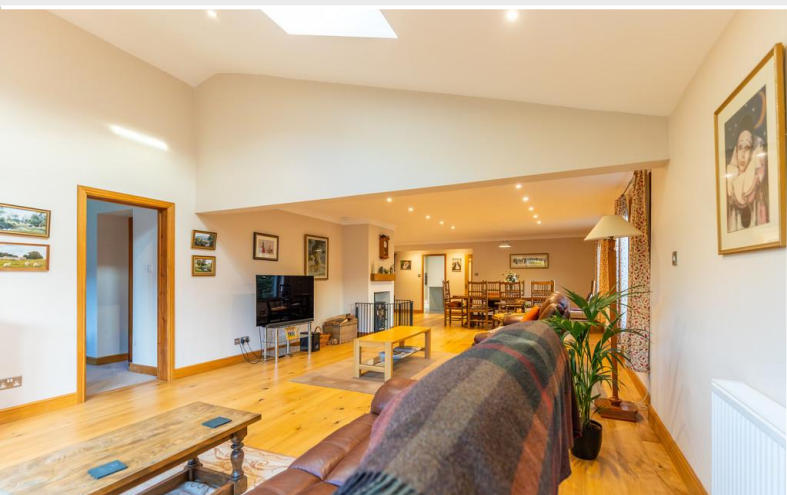
Open Plan Living / Dining Room

Directly in front of you lies Bedroom 4, a flexible space, currently housing a utility area, that could easily be transformed into a playroom or home office, offering endless possibilities for customisation to suit your lifestyle needs. This room provides access into the WC cloakroom, and an additional storage room. The utility area comprises of stainless steel sink with mixer taps. Availability for washing machine and tumble dryer. Access leading into the garage.