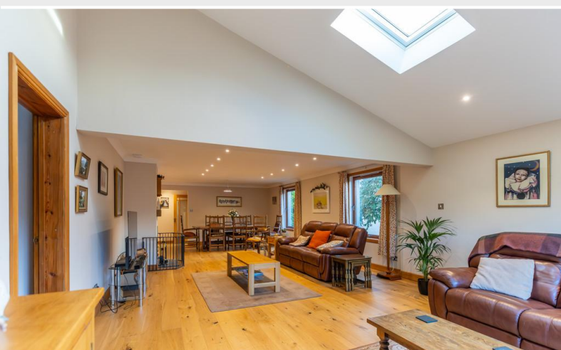
Open Plan Living / Dining Room