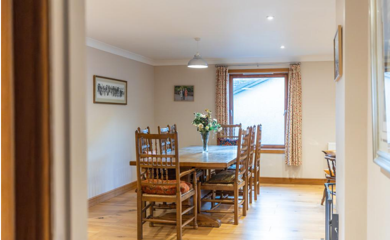
Open Plan Living / Dining Room