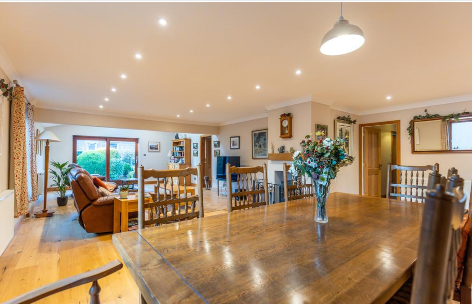
Open Plan Living / Dining Room