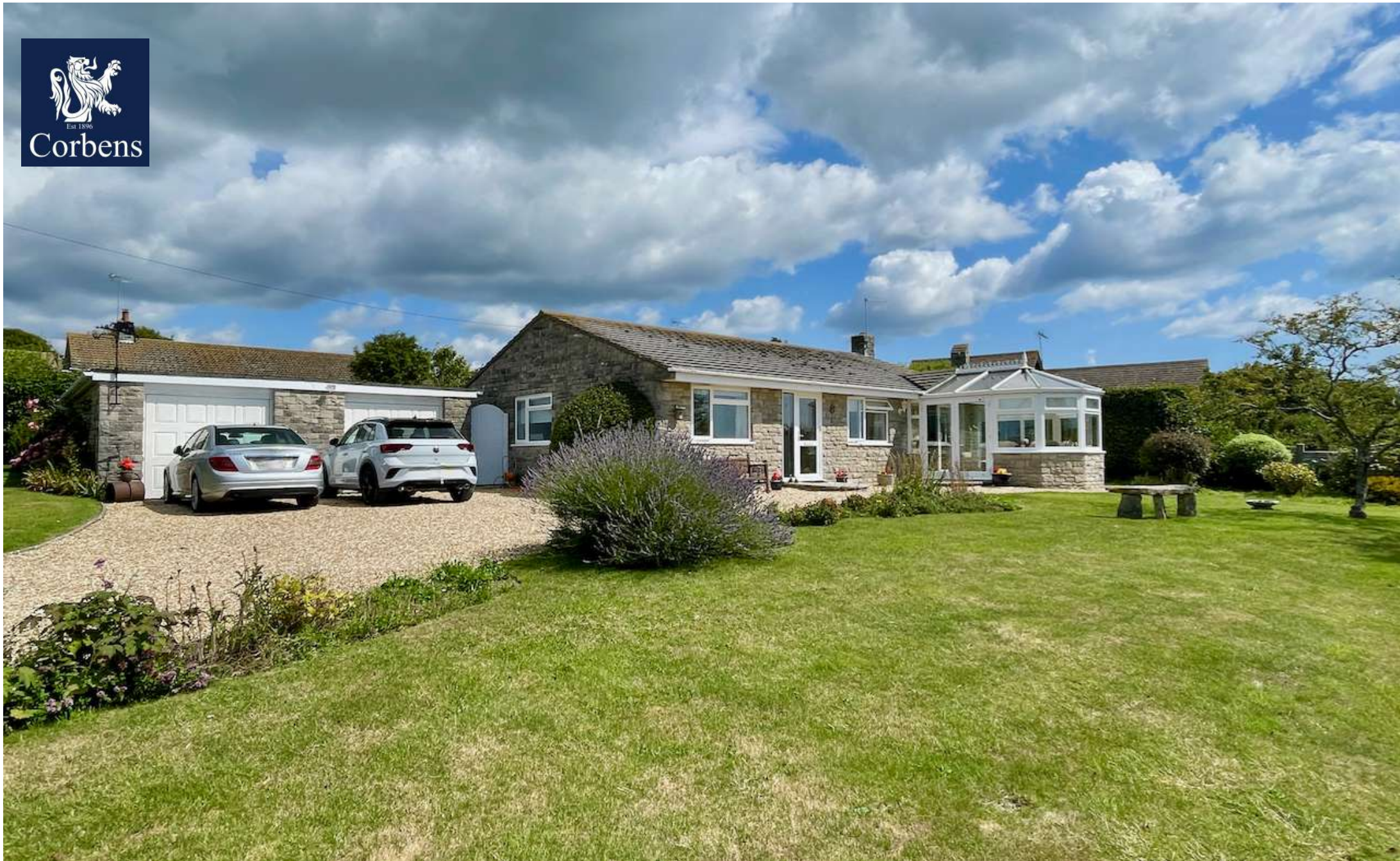
WILLOW COTTAGE, WINSPIT ROAD, WORTH MATRAVERS £965,000