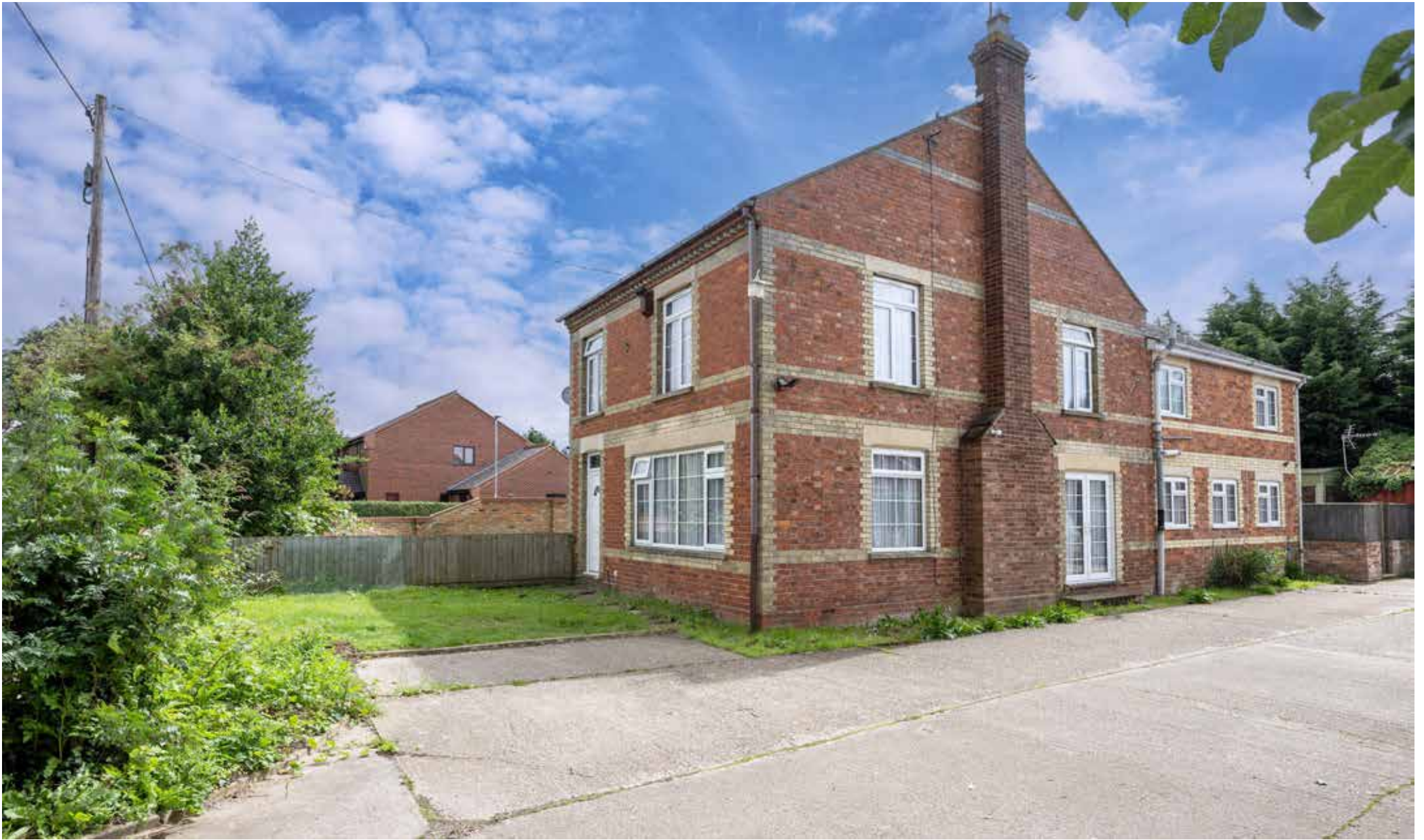
Franklin, 7 Church Road Emneth | Wisbech | PE14 8AA