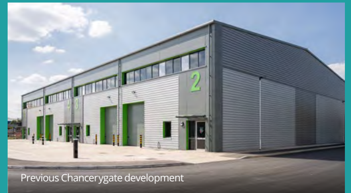
Previous Chancerygate development