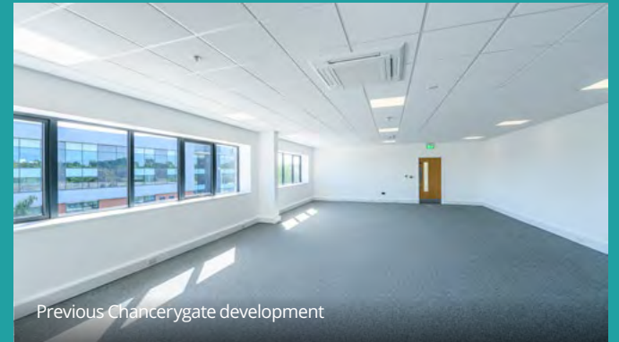
Previous Chancerygate development