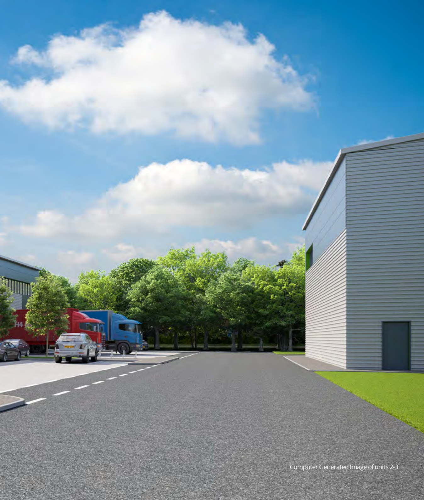
Computer Generated Image of units 2-3