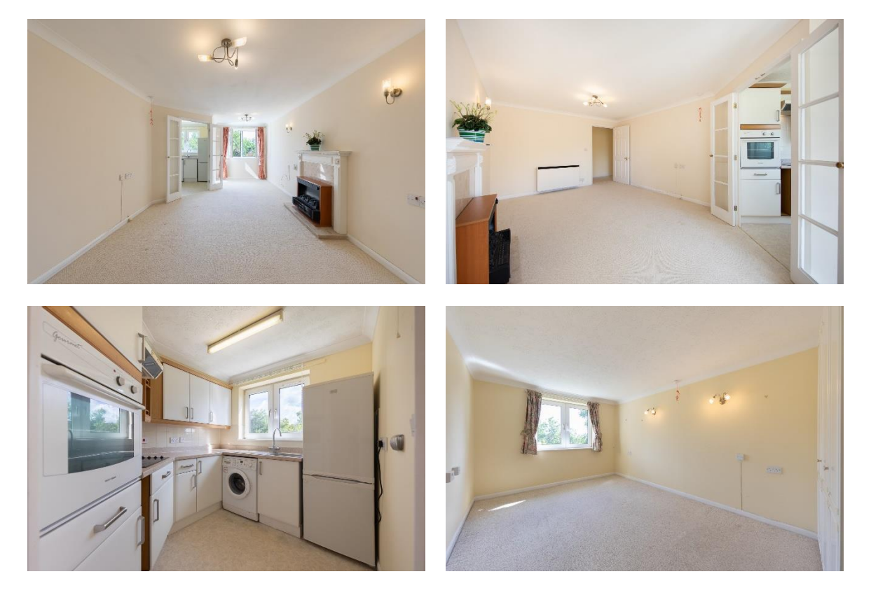
Second Floor Approx. 71.0 sq. metres (764.2 sq. feet)