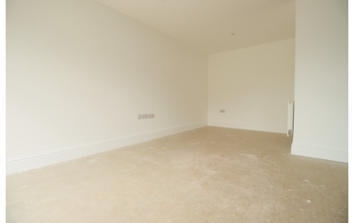
/ continued over