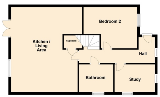
First Floor Approx. 30.8 sq. metres (331.9 sq. feet)