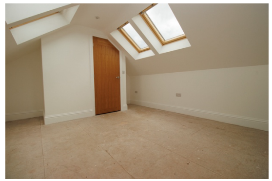
MASTER BEDROOM 3.72m x 4.65m (12'2" x 15'3")

Inset spotlights. Radiator. Upvc double glazed window. Four 'Velux' windows.