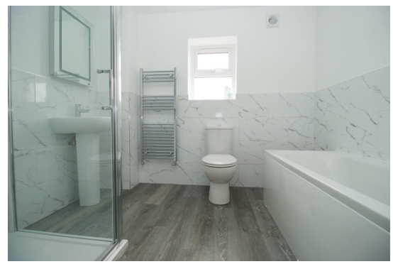
BATHROOM 2.65m x 2.16m (8'7" x 7'10")

Inset spotlights. Radiator. Upvc double glazed window. Four 'Velux' windows.