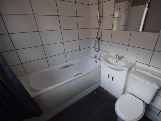
with mixer taps, cushion flooring.

BATHROOM Double glazed window to rear elevation, comprising low level WC, pedestal wash hand basin, bath with shower over, part tiled walls, cushion flooring, heated towel rail