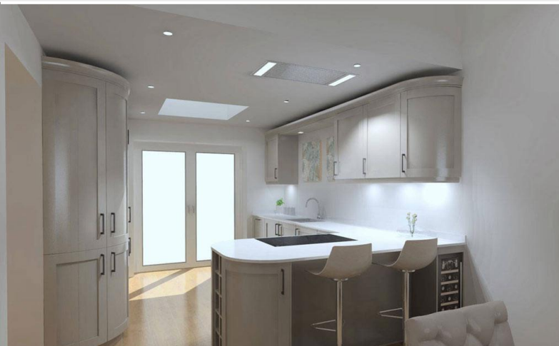
Illustration of Kitchen Designs