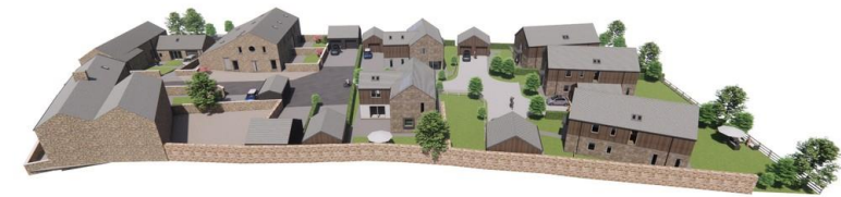
Old Hall Farm Proposed development Site Plan