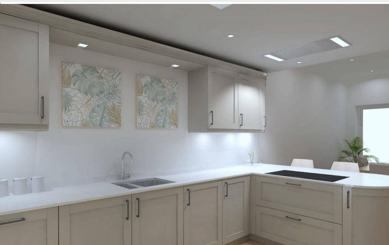
Illustration of Kitchen Designs

Location Welcome to Over Kellet, a charming village nestled in the Lancashire countryside. Here, you'll find a harmonious blend of natural beauty and a warm community atmosphere, creating the perfect setting for your new home. Close to the City of Lancaster which boasts both Boys' & Girls' Grammar Schools, two universities and a large hospital amongst an excellent selection of vibrant cultural and historic places of interest and a well-established high street shopping.