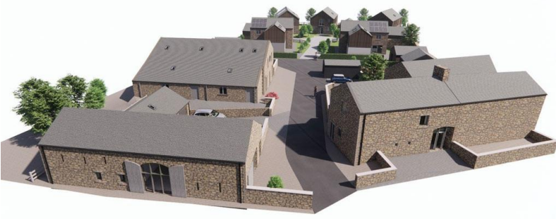
Illustration Of Old Hall Development