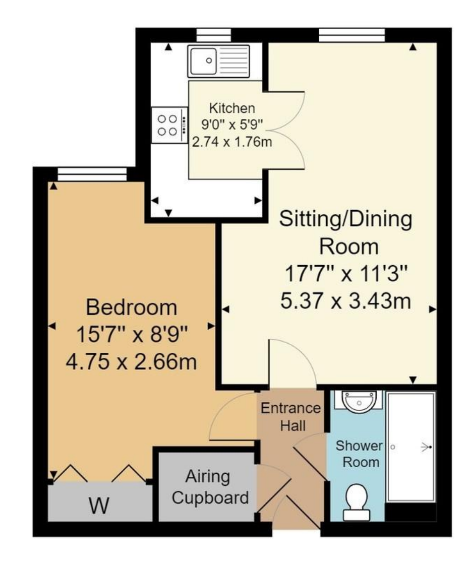
Total Area: 462 ft<sup>2</sup> ... 42.9 m<sup>2</sup>

Whilst every attempt has been made to ensure the accuracy of the floor plan contained here, measurements of doors, windows, rooms and any other items are approximate and no responsibility is taken for any error, omission, or mis-statement. This plan is for illustrative purposes only and should be used as such by any prospective purchaser or tenant. The services, systems and appliances shown have not been tested and no guarantee as to their operability or efficiency can be given.