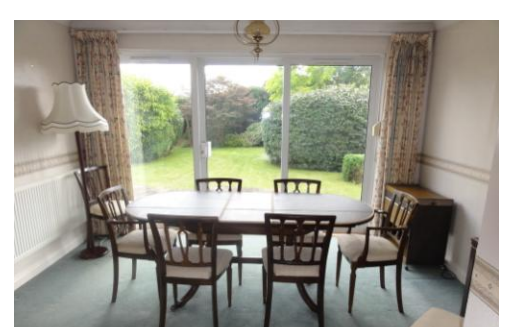
1 Treeton Road Howden, DN14 7DN