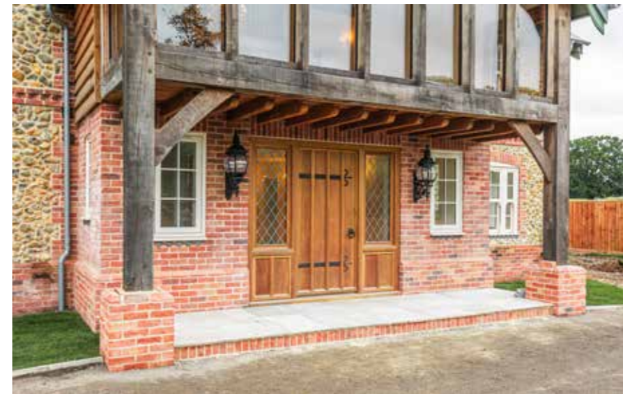
The stunning entrance to Birch House.