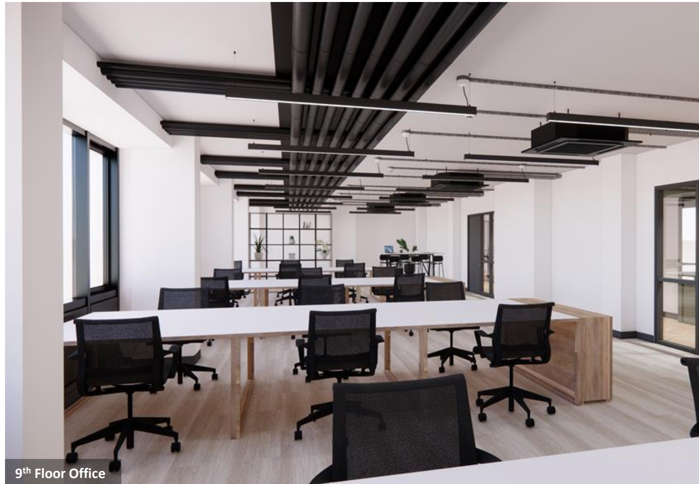
9 th Floor Office