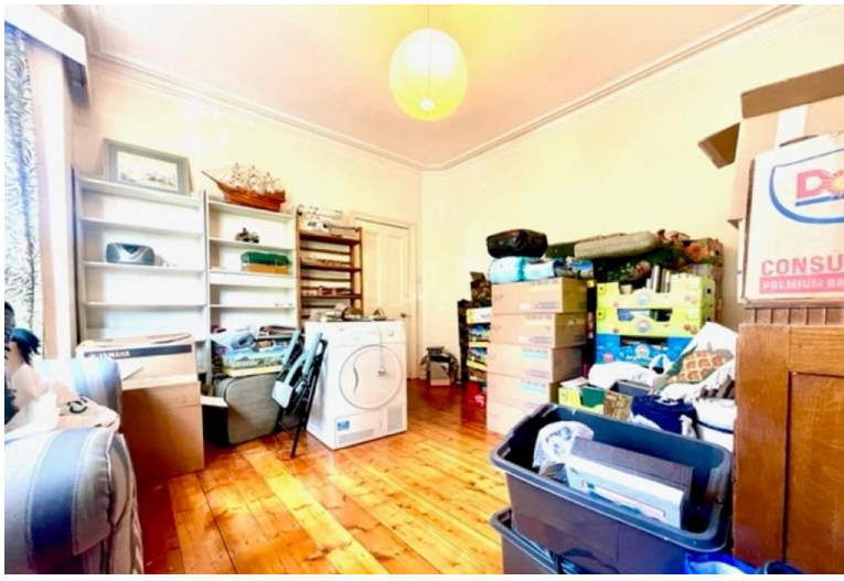
BEDROOM ONE 14' 5" x 13' 9" (4.4m x 4.2m)