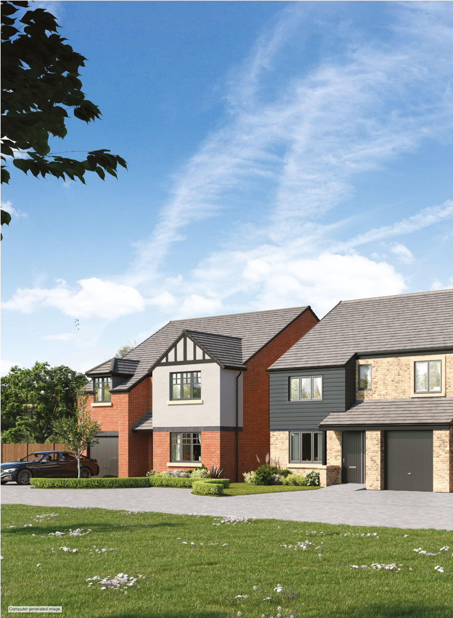
Computer generated image.