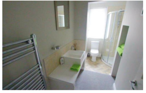
Asking Price Of £55,000