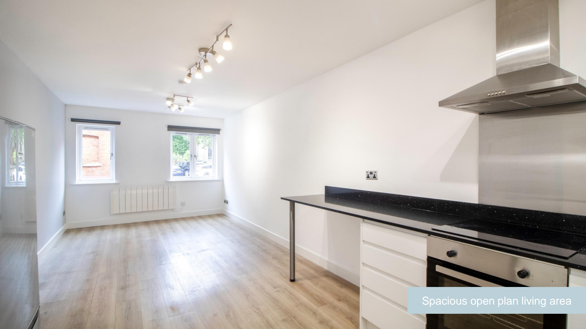
Spacious open plan living area