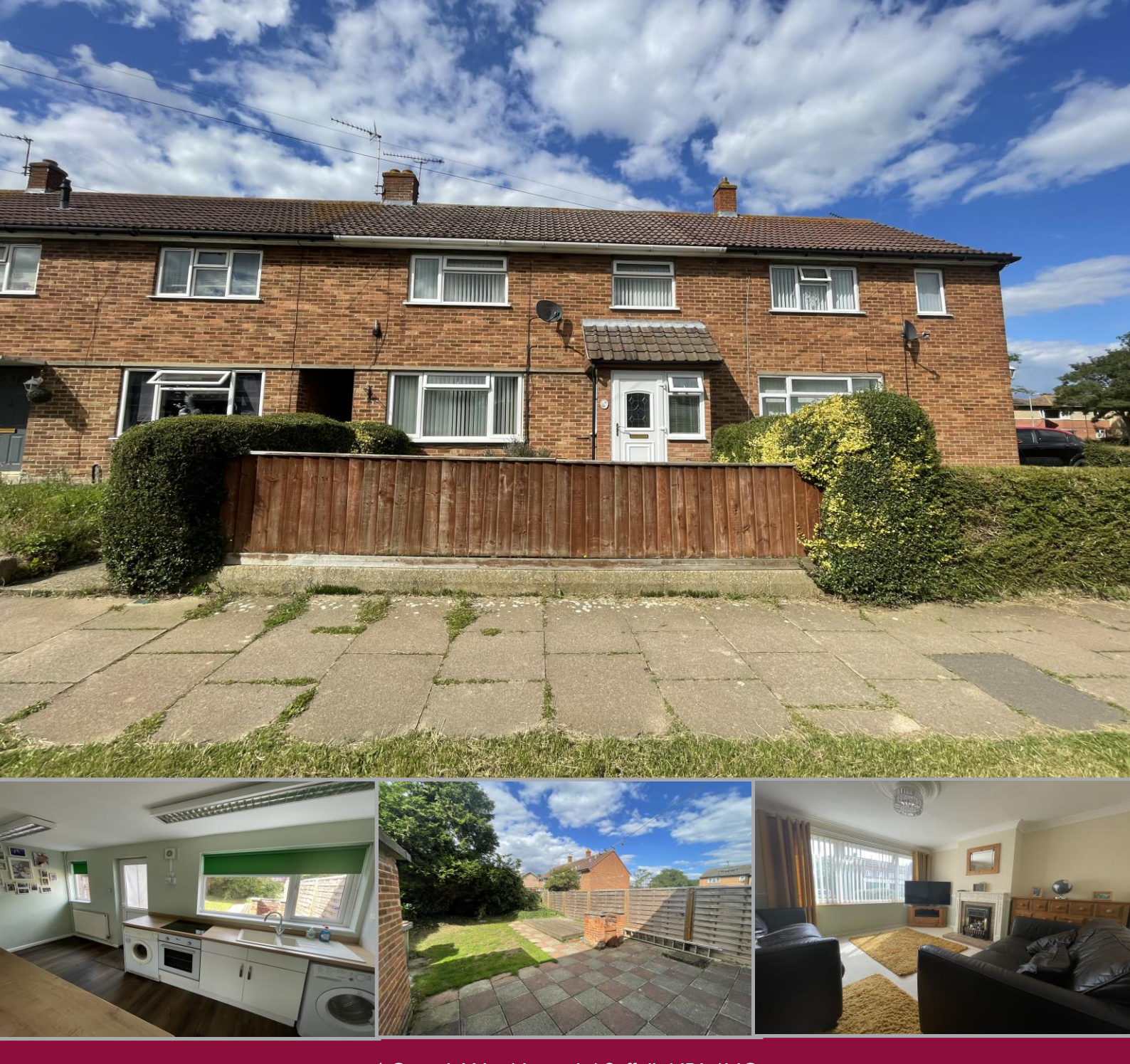
4 Garrick Way | Ipswich | Suffolk | IPI 6NG

Specialist marketing for | Barns | Cottages | Period Properties | Executive Homes | Town Houses | Village Homes