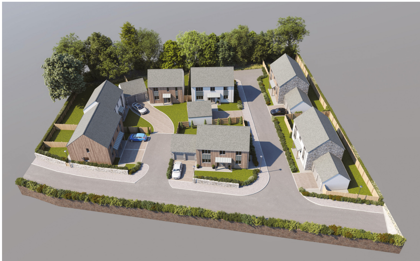
Computer generated images are for illustrative purposes only