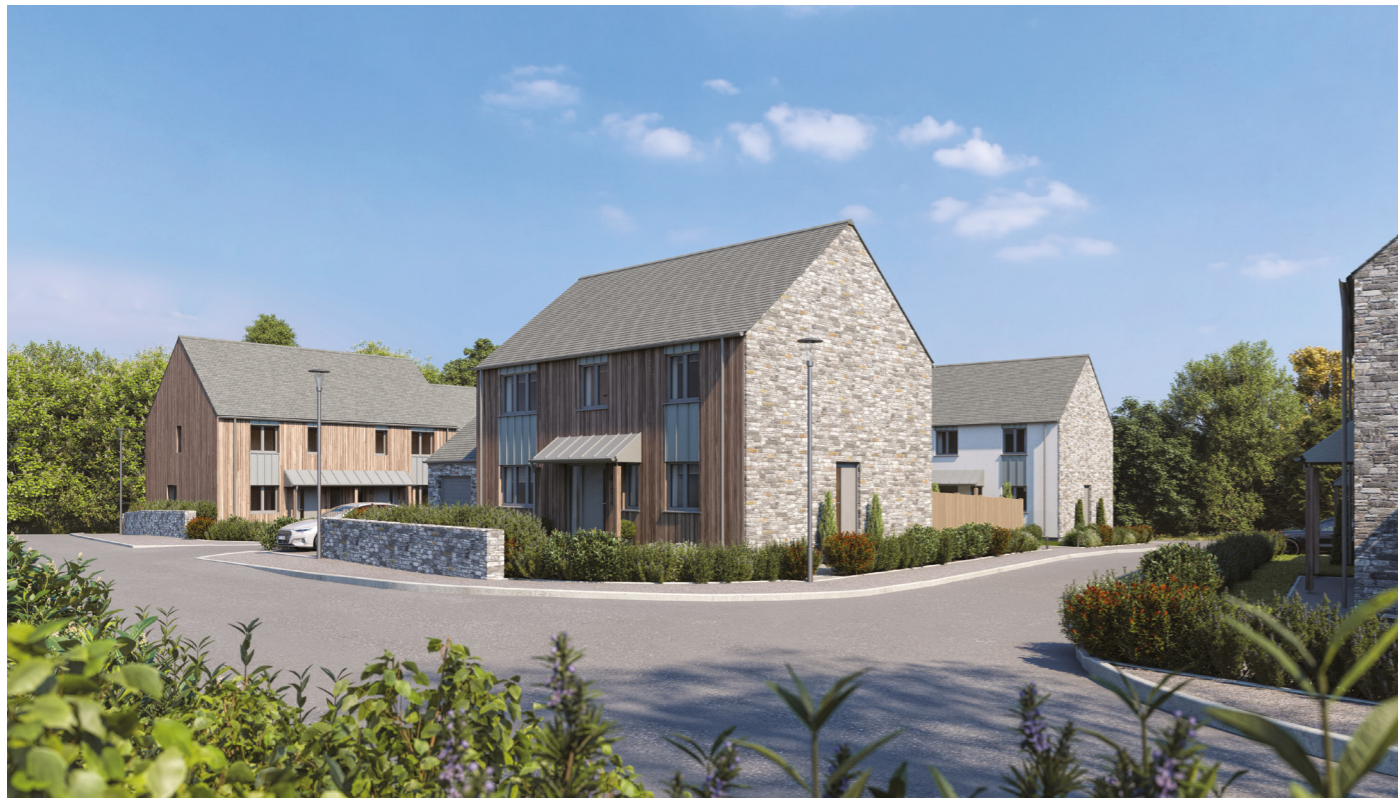
Computer generated images are for illustrative purposes only

‘Being built to Passivhaus principles dramatically increases the comfort and energy-efficiency of every Rosemoor home’