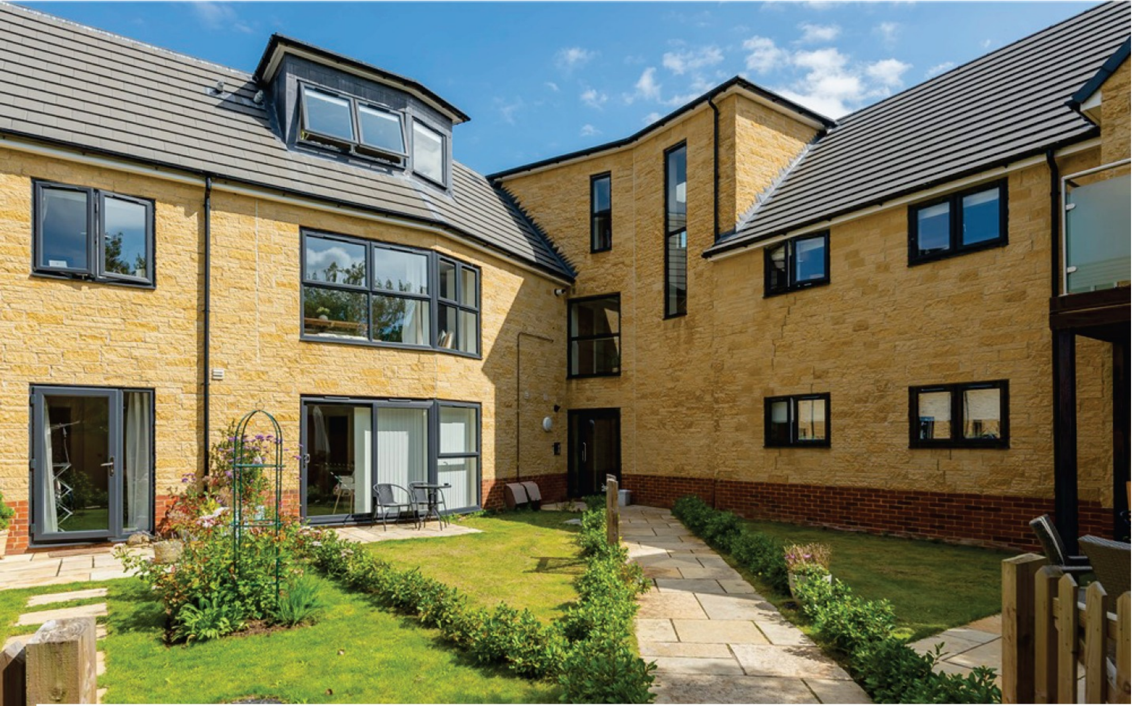
Old Orchard Court, Witney