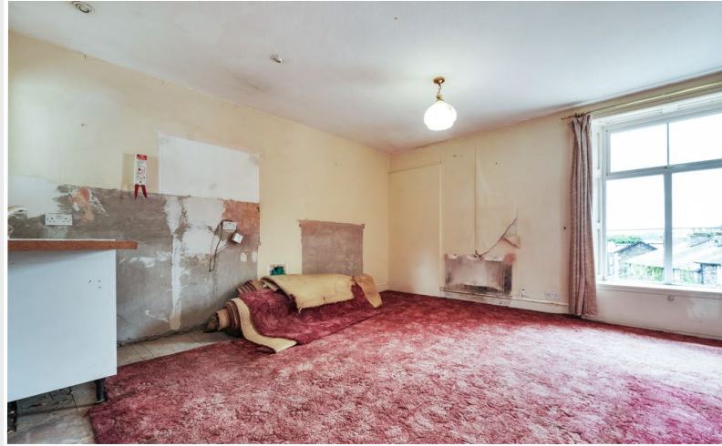
Flat 2 - Proposed Living Room/Kitchen Diner