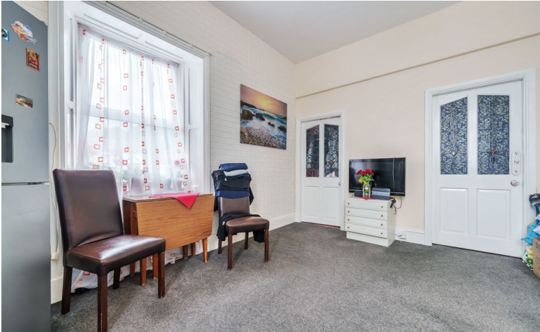
Rafters Flat - Open Plan Living Room