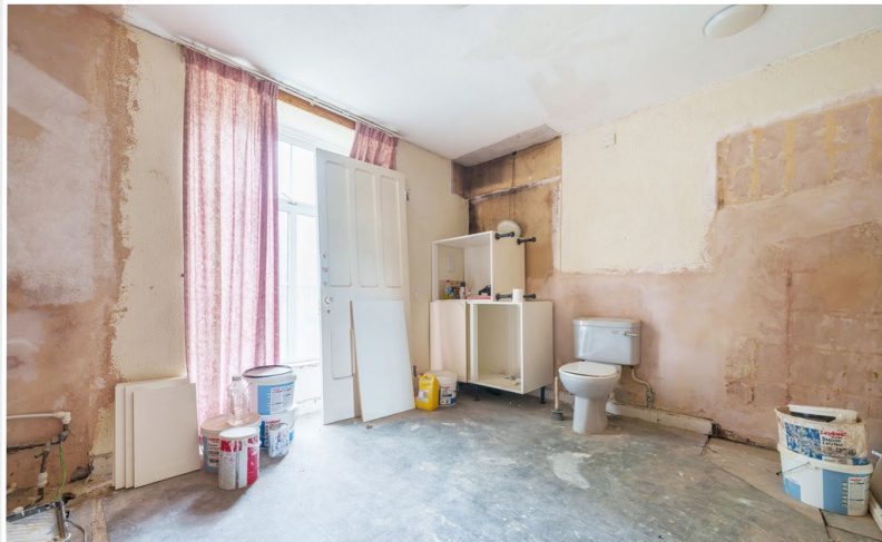
Flat 2 - Proposed En-Suite Bedroom