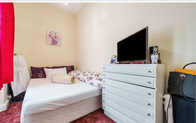
Rafters Flat - Bedroom 2