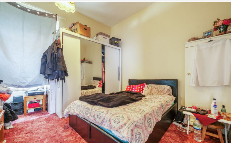
Rafters Flat - Bedroom 1