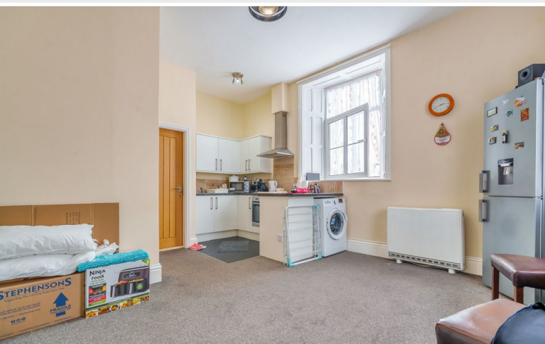
Rafters Flat - Open Plan Living Room/Kitchen