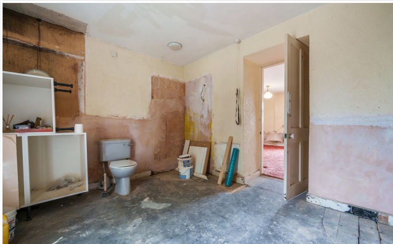
Flat 2 - Proposed En-Suite Bedroom