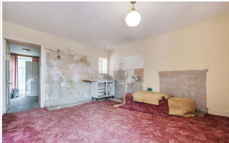
Flat 2 - Proposed Living Room/Kitchen Diner