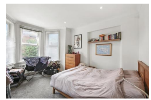
Springwell Avenue, London £325,000 Leasehold

Mile are delighted to present this spacious one bedroom flat on a residential road in NW10!