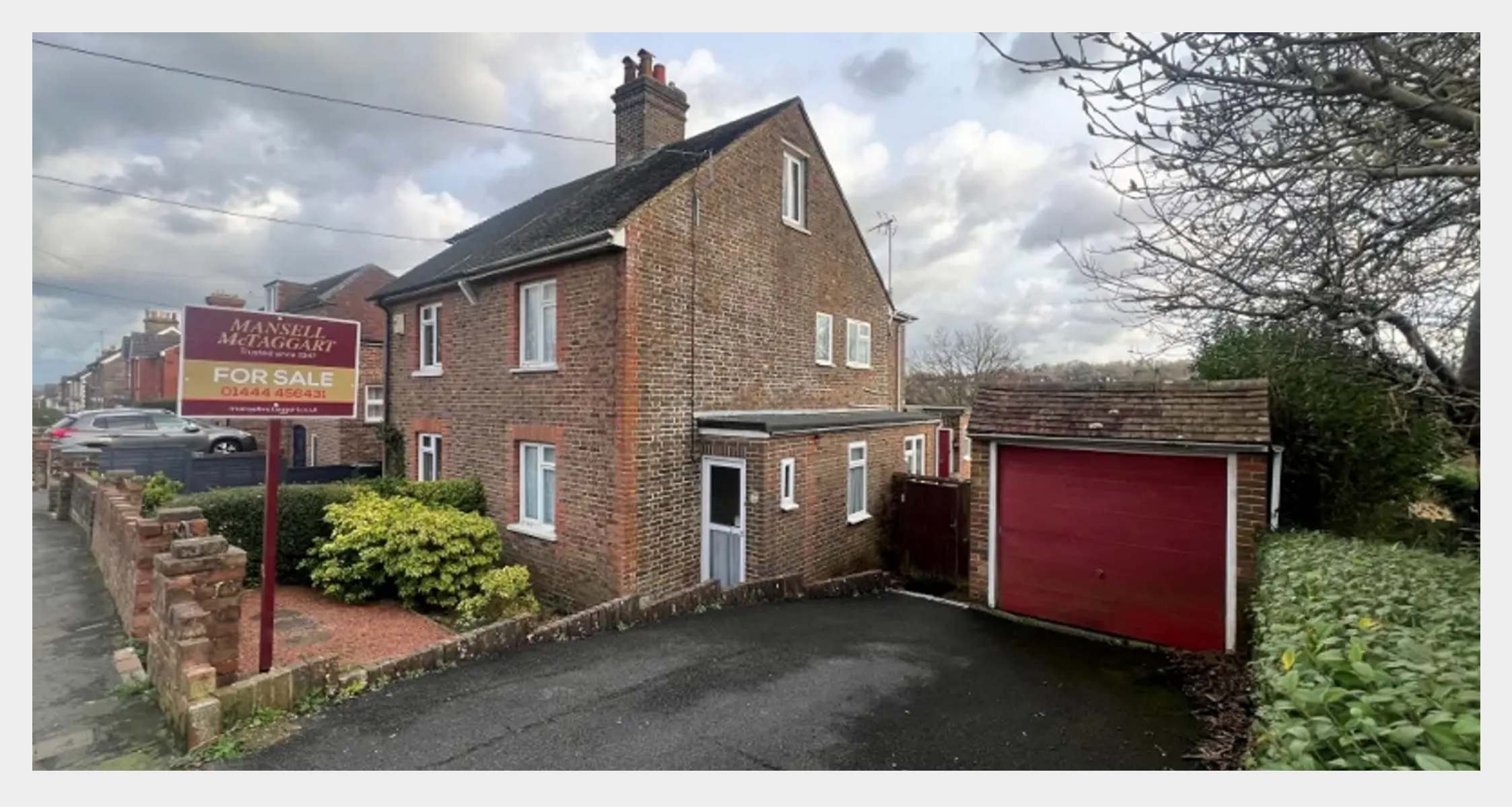
54 New England Road, Haywards Heath, West Sussex RH16 3LD