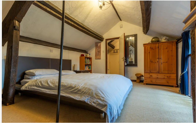
Mezzanine Occasional Bedroom/Hobbies Room