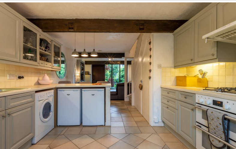
Open Plan Living/Dining/Kitchen