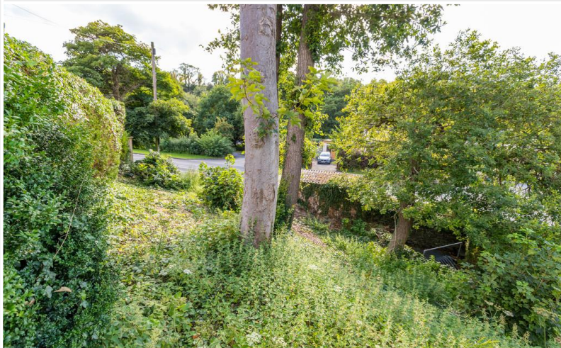
Additional Garden Area