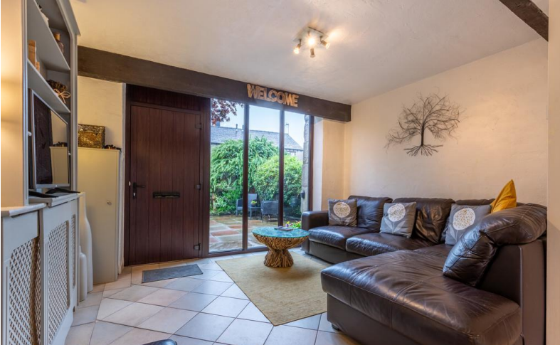
Open Plan Living/Dining/Kitchen