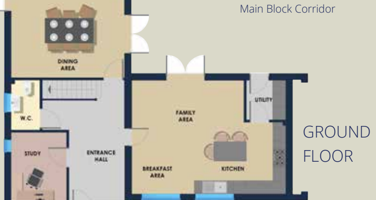
ALL MEASUREMENTS APPROXIMATE AND FLOORPLANS FOR IDENTIFICATION PURPOSES - DO NOT SCALE