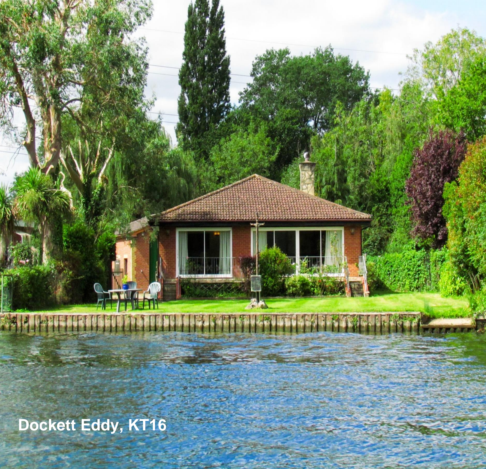
Dockett Eddy, KT16